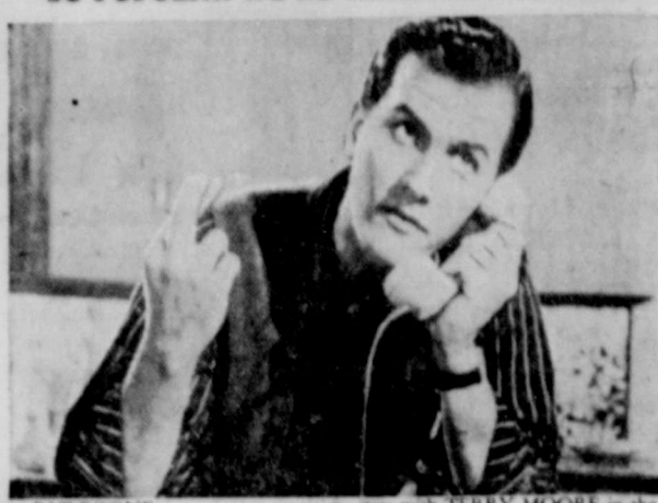
CinemaScope and color comedy, "BERNARDINE." 20th Century-Fox hit. At Majestic Last Times Today