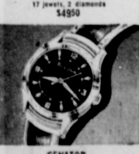
$4950 (Also available with white dial)