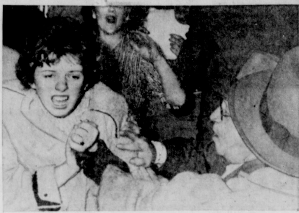
OH, SING TO ME, ELVIS—An hysterical Elvis Presley fan is restrained by two policemen as she attempted to approach the singer on a Philadelphia, Pa., bandstand. Perhaps she was overwrought because the singer was labeled as his "farewell" before entering the Army.