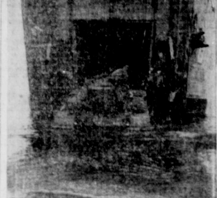
ISLAND-HOPPING-A tank from Schofield Barracks, located near Henolulu on the Island of Oahu, disembarks from the Navy LST that transported it for maneuvers on the big Island of Hawaii.