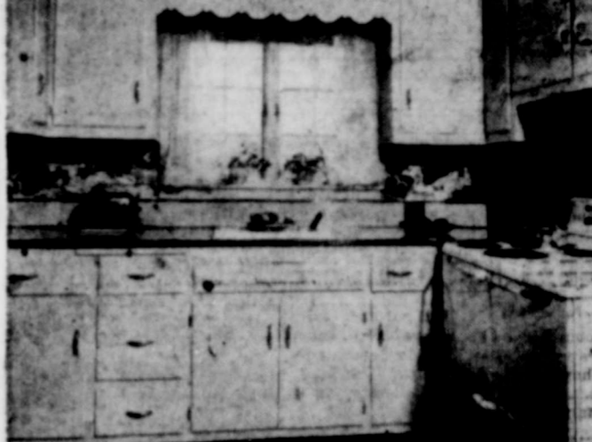
Below, you see what a modern floor covering can do all by itself. The only substantial change from the old kitchen is a new floor covering - inlaid linoleum in the new Gold Seal "Starway" pattern by Congoleum Nairn Inc. But what a difference! The little kitchen now looks serene and spacious. The light floor looks larger and cleaner, fitting the fine modern equipment. The smart wallpaper shows to full effect, relieved of the competition of a busy floor covering. Once again, a change of floor covering has shown the decorative importance of what's underfoot.