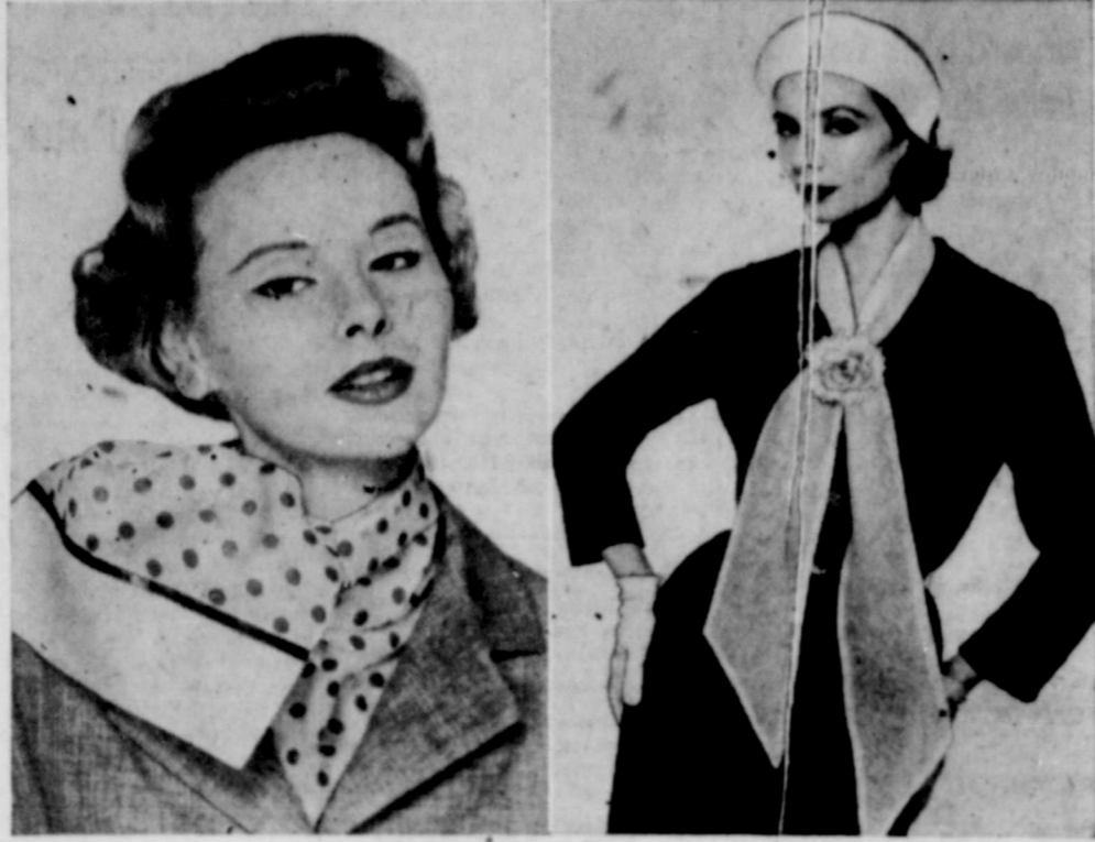
STYLES come and go as the whims of fashion designers dictate, but scarves are as constant as the first robins with their perennial message of spring. Shown at left is a frothy, white organza, polka-dotted in navy. Made to tuck into the neckline of a spring suit or suit-dress, the oblong scarf has a narrow band of navy satin at each end. At right, a sheer, white organza Ascot is caught by a flower made of the same fabric to add a springtime touch to last season's dark dress. This wardrobe-stretcher can be tied, in a bow or it can be permitted to stream down the front of the costume.