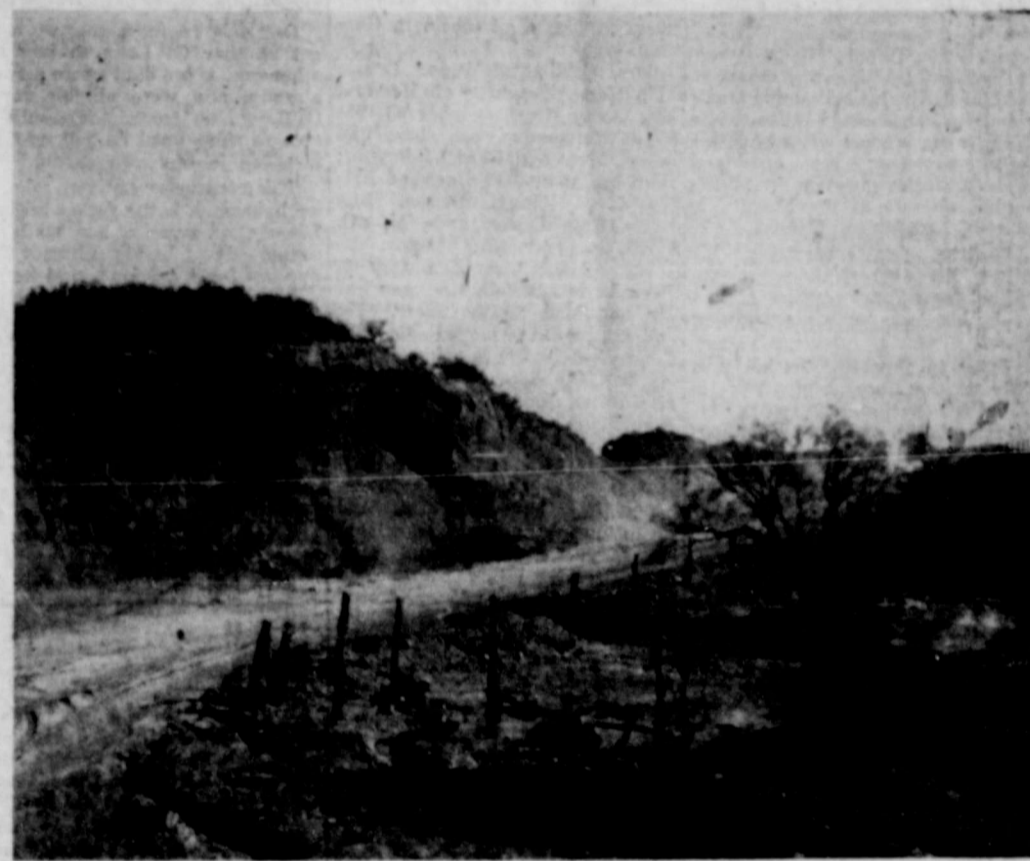
IN THE PICTURES—Top picture is one of the two new 85-foot kilns being moved into position. The Featherlite Company here already had four 70-foot kilns in use, and by transferring those at Strawn to Ranger, together with the new 85-foot giants, the total number of kilns in operation here will be nine. Lower picture shows one of the small mountains of shale near here which is used in making the Featherlite Aggregate. The company will have in all around 300 acres of shale to be used in manufacture of the product, an almost unlimited supply. In addition to using the Aggregate in the manufacture of building blocks, it is now being used extensively in place of sand and gravel in mixing concrete. The State of Texas may soon be using the product in the construction of roads, and experiments have shown that even telephone poles can be made from it. Uses for the Featherlite product may prove to be unlimited.