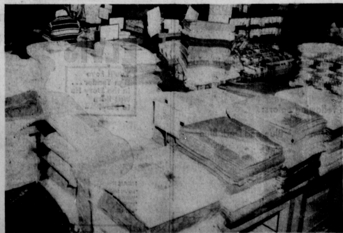
BEDDING FOR CHRISTMAS—Pictured above is a small section of the bedding department at J. C. Penney Company in Ranger, which always winds up with a sell-out before gift-buying season is over. Among many other gifts at Penney's, the bedding department this year features a wide selection of blankets, spreads and comforters in a variety of price ranges and a veritable rainbow of colors. Along with bed coverings, Penney's also is featuring their famous lines of sheets and pillow cases which are always high on anybody's gift list because, like money, it is something a family seldom gets overstocked on. Penney's is ready with extra salespeople to take care of the final shopping rush.