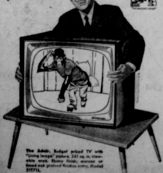
The Adeb. Budget priced TV with "Living Image" picture, 261 sq. in. viewable area. Ebony finish, mahogany or bead oak grained finishes extra. Model 2177L.