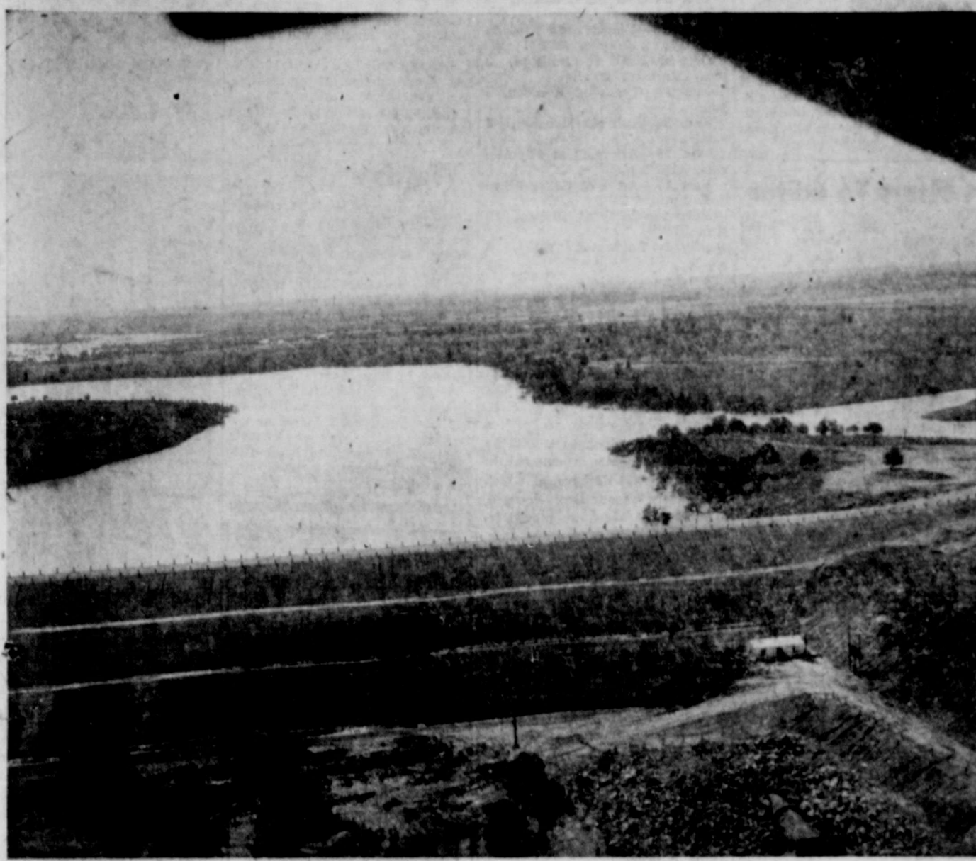
'FISHERMAN'S PARADISE'—An aerial view of Lake Leon showing the $1 1/2 million dam in the foreground. A 27-foot road crosses the top of the dam. Completed some 2 1/2 years ago, the 28,000 acre-foot lake will eventually have a 35-mile shoreline. Just east of the dam, in the lower left-hand corner of the picture, can be seen a site that is ideally situated for a picnic and park location, also parking grounds could easily be constructed with very little cost, and would be an added attraction to local residents and out-of-area fishermen and their families making this "emerald jewel" one of the better spots for recreation in Texas.

TV HEADQUARTERS RCA, Admiral, Philco, Zenith L & J SUPPLY CO.