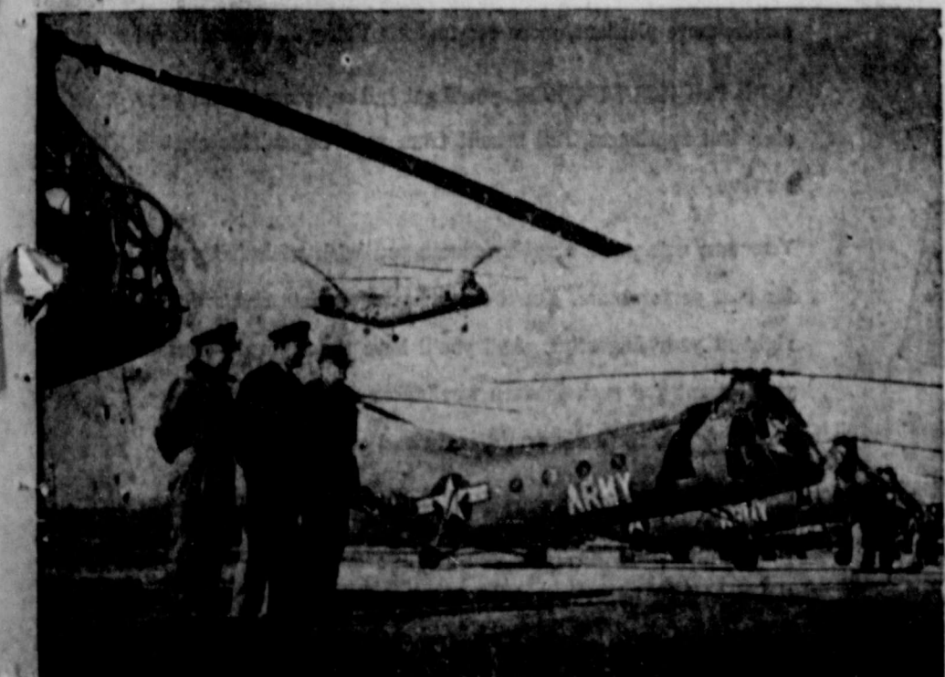
PARADE REST —The men and the transport aircraft of the Army Transportation Company (helicopter) stand ready for inspection at the Davison Army Airfield, Fort Belvoir, Va. Twenty-one transport aircraft are assigned to the company, which had a busy year what with disaster work in the Eastern States, transporting the cabinet to Camp David to meet with the President, and "evacuating" Department of Defense by personnel during Operation Alert, this in addition to normal duties.