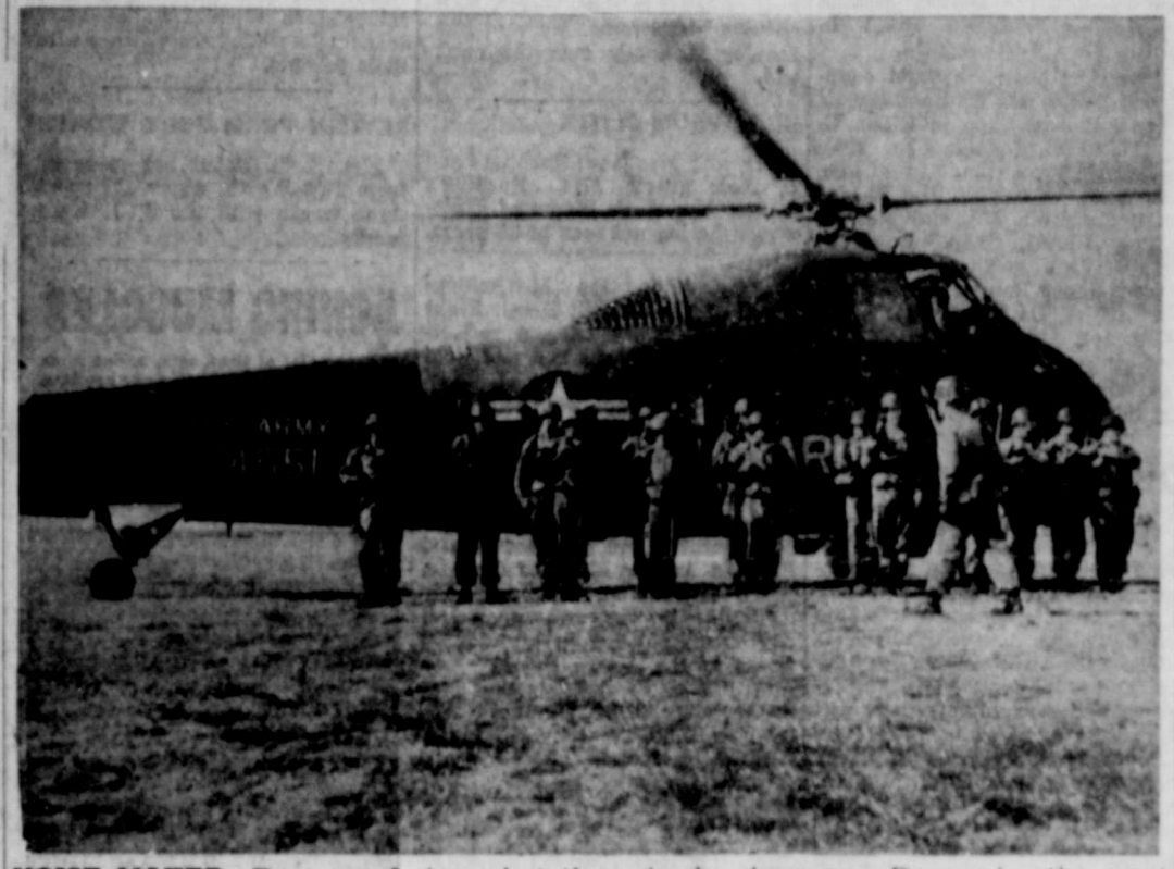
vetts Haley seems to be just few weeks? If you have bothered to look up, you have no doubt spotted one of these strong as anybody in the versatile H-34 helicopters. In the picture above an infantry units prepares to board the Dallas Fort Worth area, but we're aircraft at Camp Wolters, near Mineral Wells.