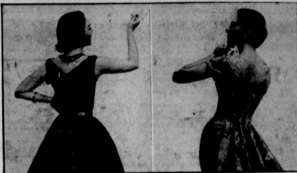
HERE'S THE "BACK" OF FASHION'S SUMMER PICTURE - Jet cotton blouse with a back bow, at left, is combined with a gold-splashed cotton print skirt for summertime "at home" and resort wear. Gold kid belt completes the ensemble. At right, middle-of-the-back neckline and pleated bustle is featured in this dress-up cotton. The print is highlighted with bits of rhinestone and jet scattered over bodice and skirt. Both numbers warmed buyers' hearts one cold winter day at a recent New York City showing.