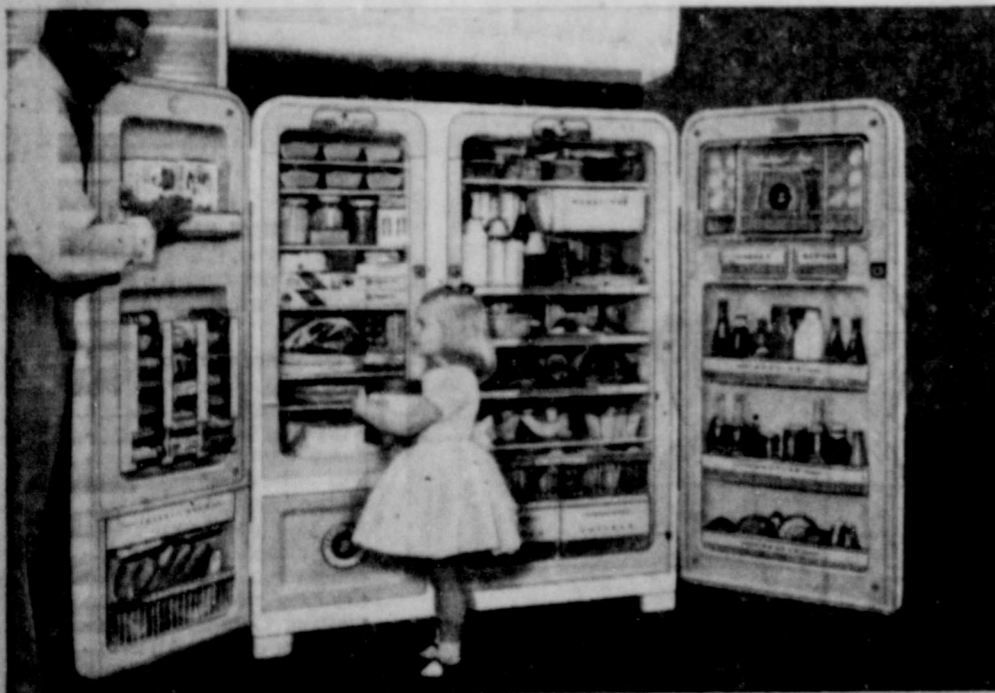
A 166-lb. Upright Freezer and an 11 cu. ft. "Moist-Cold" Refrigerator both in a cabinet only 47 inches wide.

New magic for your kitchen—America's most exciting foodkeeper