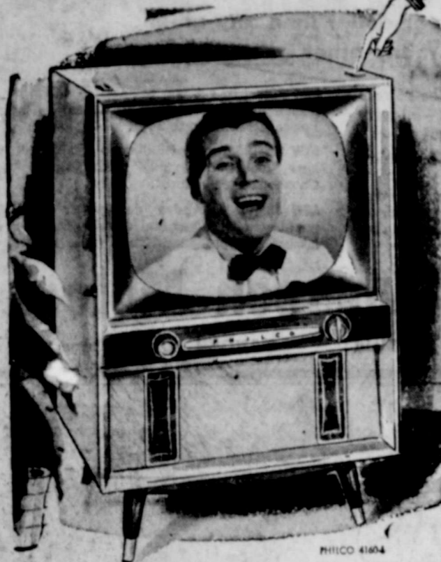
Brand New 1956