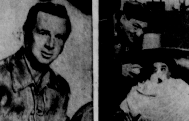
Last Command Jail Busters