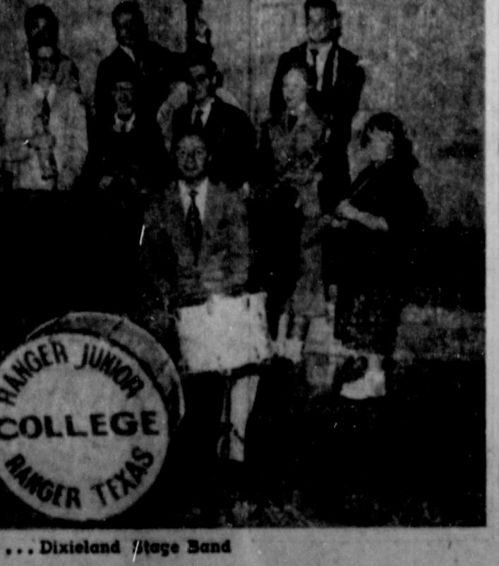
... Dixieland /age Band

BOATS & MOTORS Marine Headquarters L & J SUPPLY