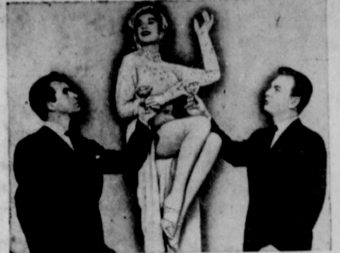
Fernando Lamas and Eddie Albert drink a toast to Rosalind Russell who stars in her first singing & dancing lavish super musical "The Girl Rush" playing Sunday and Monday at your Tower Theatre. The laugh-loaded Vistavision, Technicolor extravaganza, set in glittering Las Vegas.

Somebody is behind you. Be aware how you lead them. This is responsibility. The only way to be a real friend to man is to have the proper relationship to God.