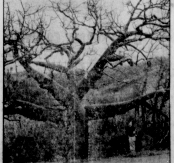
HANG YOUR SHIRT ON A KAPOK LIMB —That's what Ecuador's Ministry of Economics would have you do, as it announces that it is making large tracts of land available to those who would cultivate the living "general store," hitherto harvested only from wild growth. Bark is used in manufacture of twines, sacks, nets, hammocks and cloth. Hairlike fruit fiber, lighter than cotton, is used for stuffing floats, life preservers, cushions. Seed fiber, very elastic, far exceeds cork in flotation qualities and is used in lifesaving devices, clothing and upholstery. Seed also yields oil for soap making and feed cake for livestock. Tree is said to be both rain and drought resistant.

The chances of a perfect fishing weekend at Lake Leon seemed nil today after the first definite norther of the season whistled into this area Thursday, dropping temperatures as much as 10 to 12 degrees in an hour. Some of the older fishermen, however, who have tried their angling luck in such weather as this, say this is it.