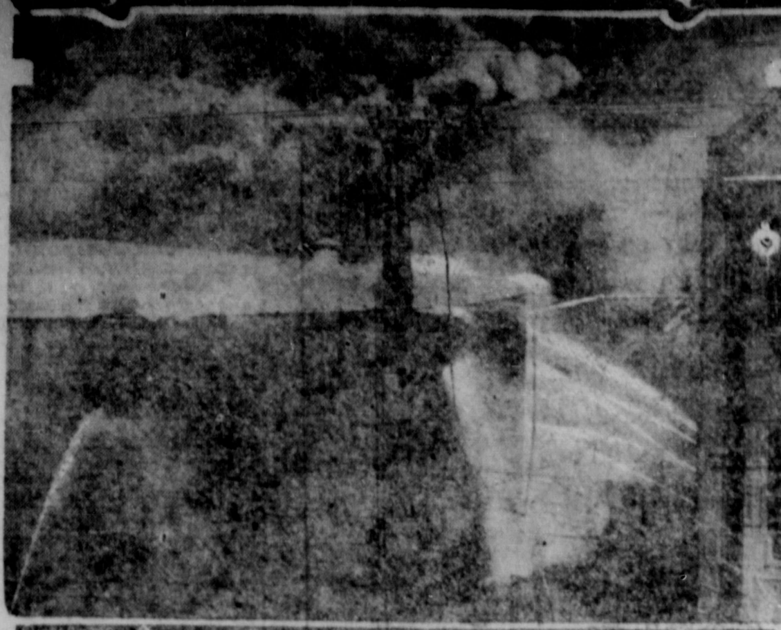
Remarkable photo showing linemen repairing telephone and telegraph wires near blazing oil tank at Standard on Long Island. Tank in danger of exploding at any moment. Note ten streams of water playing on tank.

The most spectacular fire in the history of the New York fire department recently destroyed over $2,000,000 worth of oil at the Long Island plant of the Standard Oil