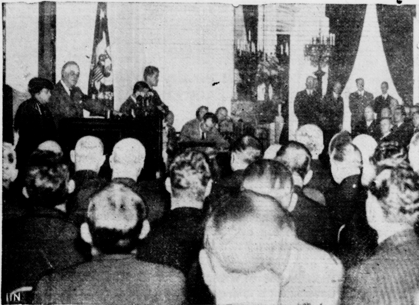
President Roosevelt is pictured as he addressed 250 delegates of the International Labor Organization in the East room of the White House. The president condemned the "misguided" few industrialists and labor leaders "who place personal advantage above the welfare of the nation." Secretary of Labor Frances Perkins stands beside the president.