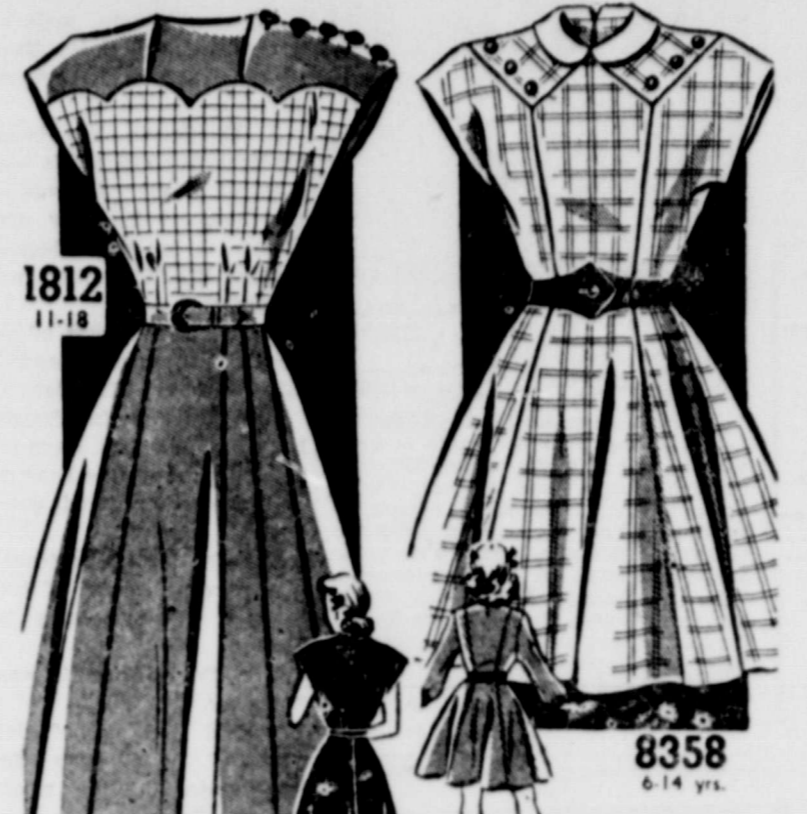
School Dress A PRETTY and very practical school dress for the grade school miss.

For special dates or week-end festivities, wear this youthful junior frock that uses two fabrics so effectively. The yoke is outlined in scallops and buttons on one shoulder; the skirt is nicely gored.