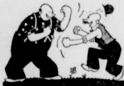
The Morning After Taking Carter's Little Liver Pills