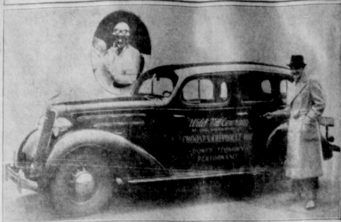
"Wild Bill" Cummings, national A. A. A. racing champion, recently took delivery of his second Chevrolet—a new 1935 Master De Luxe sedan with which he is pictured above. Cummings became a Chevrolet owner following his victory at Indianapolis Decoration Day. In the oval he is shown as he finished the Indianapolis classic, wearing the new type crash helmet that was recently adopted by the A. A. A. Contest Board for all racing drivers in 1935.

Few grains of nutmeg. Beat your egg white until stiff but not dry; add egg yolk and beat until thick and fluffy. Now add your karo, salt and milk. Pour mixture into chilled glasses or over cracked ice, if you wish. Sprinkle nutmeg on top and serve at once. For a special drink, (or just for a change) you might like to add orange or pineapple juice to the beaten egg just before you add the milk.