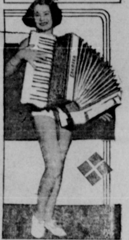
Remember "Baby Peggy" of screen fame just a short while ago? Well, Peggy has grown, as little girls always have done . . . and here is "Baby Peggy" today, whose last name is Montgomery and who is still in the entertainment field.