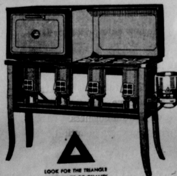
LOOK FOR THE TRIANGLE TRADE MARK OF QUALITY

A Liberal Trade-In For Your Old Stove Baker Mercantile Co