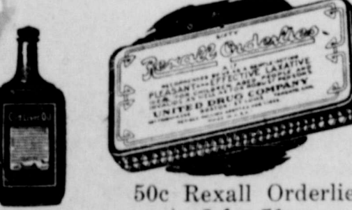
50c Rexall Orderlies