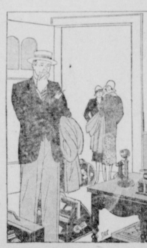
"Something should be done about this"

Vacation rates are available for periods of more than 30 days. They apply only to residence telephones - not to business or rural service.