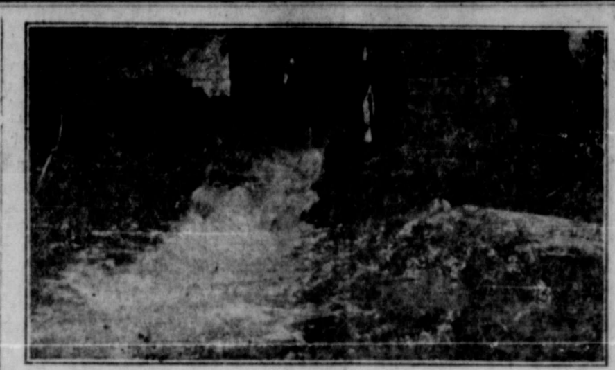
An irrigation Well near Lockney pumping 2,000 gallons of water per ported last night. minute. Such a well can be had on every acre of ground in the great

is turning out from 15 to 25 bushels to the acre.