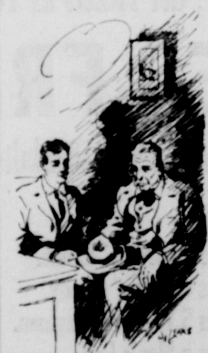
"I-I Can't Take the Chance."

"No," came hopelessly, "I've thought more tenight than ever before in my life. But I can't do it. I might only