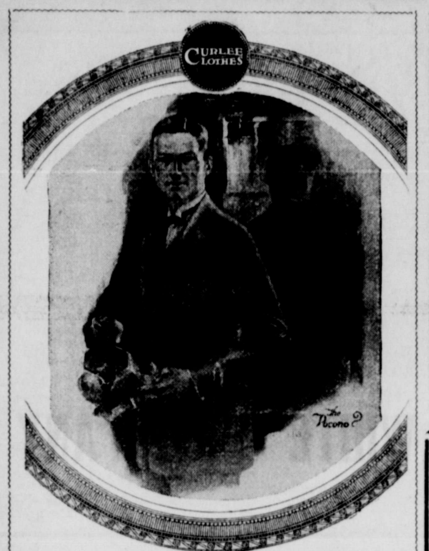
"Get in the Well Dressed Circle Good Clothing that you can afford to Buy.

and the Christmas Tree is a fine opportunity to scatter good cheer to all. Buy gifts that will be appreciated by all the family. You can find such gifts here in abundance.