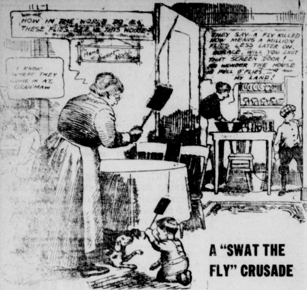
A "SWAT THE FLY" CRUSADE

In the home is a very laudable thing, we'll admit, but a little careful screening will easily eliminate the worry and trouble.