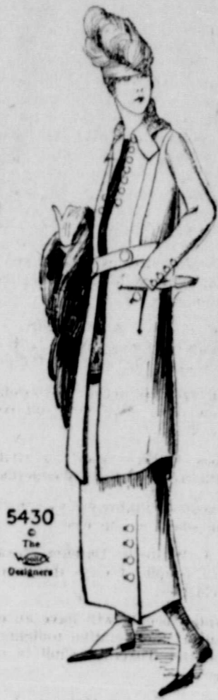
5430 The Groggers

33 1-3 Reduction on all Suits and 33 1-3 Per Cent Reduction on all Suits and Dresses