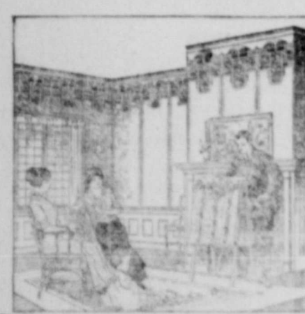
The choicest declars and colorings.