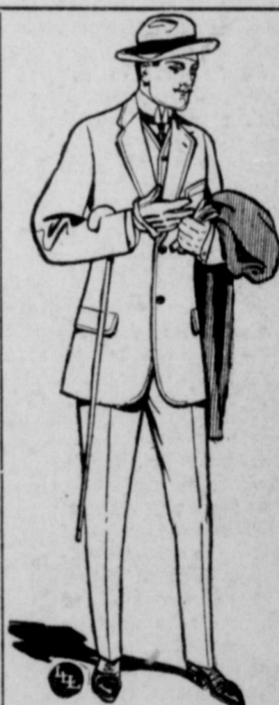
A Sample of our Late Styles