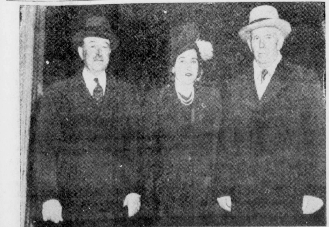
IT'S A GRAY HOMBURG NOW—Field Marshal Viscount Alexander of Tunis, Governor General of Canada, and Lady Alexander are met by Secretary of State George C. Marshall as they arrive in Washington for a two-day visit. Later they were received by President and Mrs. Truman.