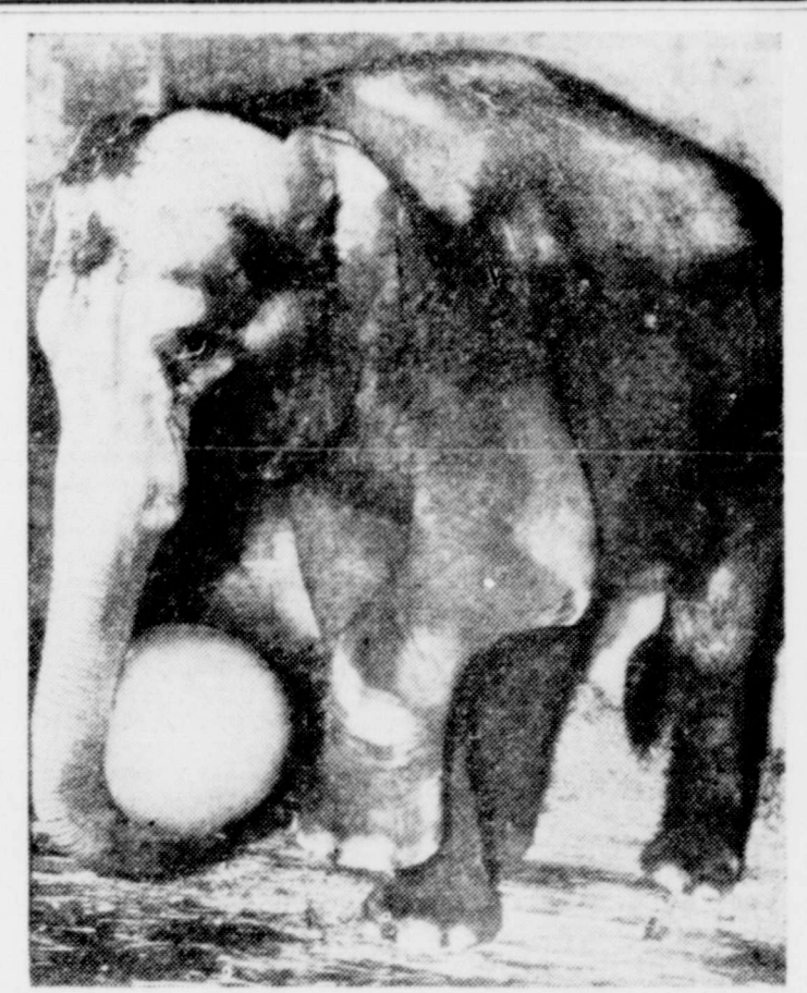
BURMA IS ATHLETIC—Burma, an elephant at the Philadelphia Zoo, enjoys herself in her stall by playing a game of soccer, caring little that on the outside Philadelphia was experiencing its lowest temperature for current winter season.

In signing the bill, Gov. Jester announced that the welfare department has geared its entire facilities to making the increases available in the checks that will go out March 1. He said the automatic effect will be to increase monthly payments to approximately 191,000 aged people an average of between $2.50 and $3 a month. The 5,100 needy blind will receive between $500,000 and $600,000 more monthly and the 30,000 dependent children on the state rolls will get approximately $200,000 more a month as a result of the new law.