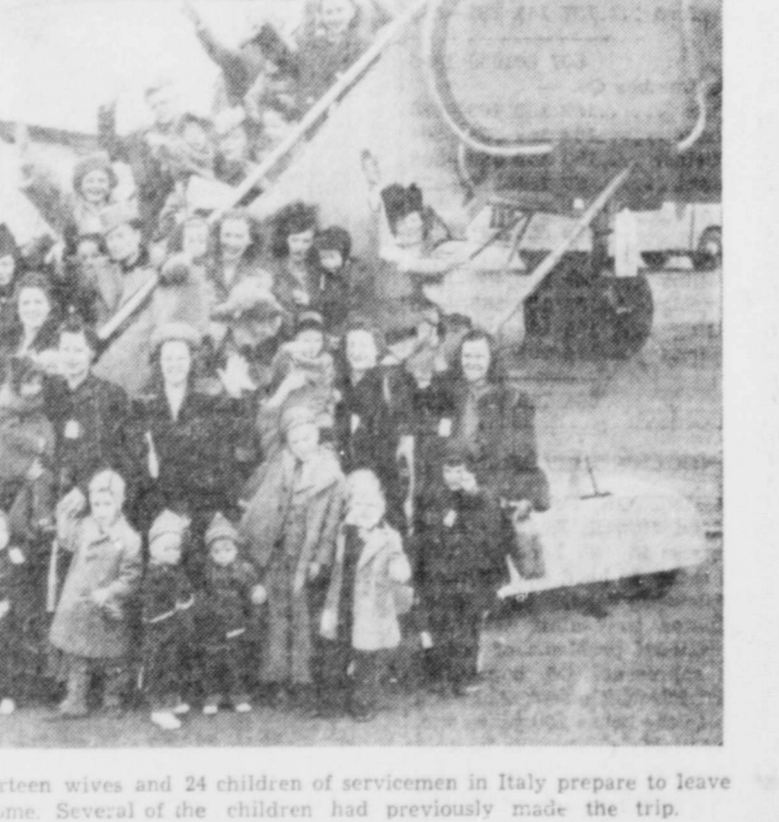
YOUTH CONVENTION—Fourteen wives and 24 children of servicemen in Italy prepare to leave LaGuardia for flight to Rome. Several of the children had previously made the trip.