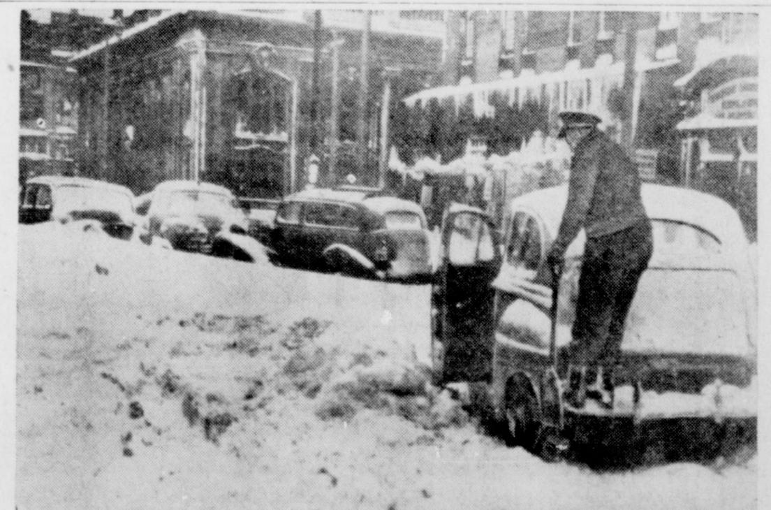
TROUBLE BREWED IN MILWAUKEE—When one of the worst storms in midwest history hit Milwaukee, roads in and out of the city were closed. Buses and cars were used as sleeping quarters by those who were unable to reach home after the storm struck.

The estimate—a theoretical one—was made by Coal Attorney James W. Haley, who appeared before the house judiciary committee. Haley testified after the wage-hour administration asked for power to make binding interpretations of the wage hour act which would prevent recurrence of back portal claims.