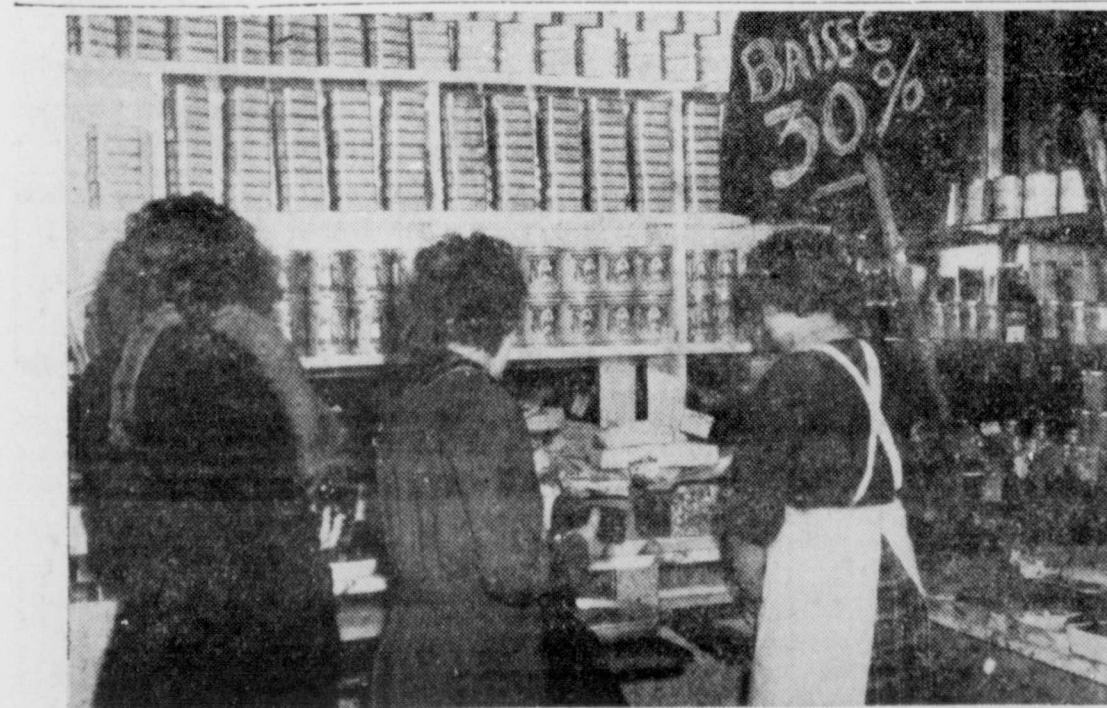
THE PRICE PENDULUM SWINGS BACK in Paris. Here French housewives take advantage of sign announcing 30 percent slash in prices as they stock up on food at this grocery store in France's capital. Many stores exceeded former Premier Blum's ordered decrease of five percent.