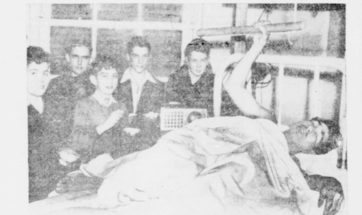
LIMITED WORKOUT —World featherweight champion Willie Pep, recently injured in a plane crash in New Jersey in which three persons were killed, entertains youthful visitors in hometown hospital in Hartford, Conn. The kids brought the fighter ice cream.