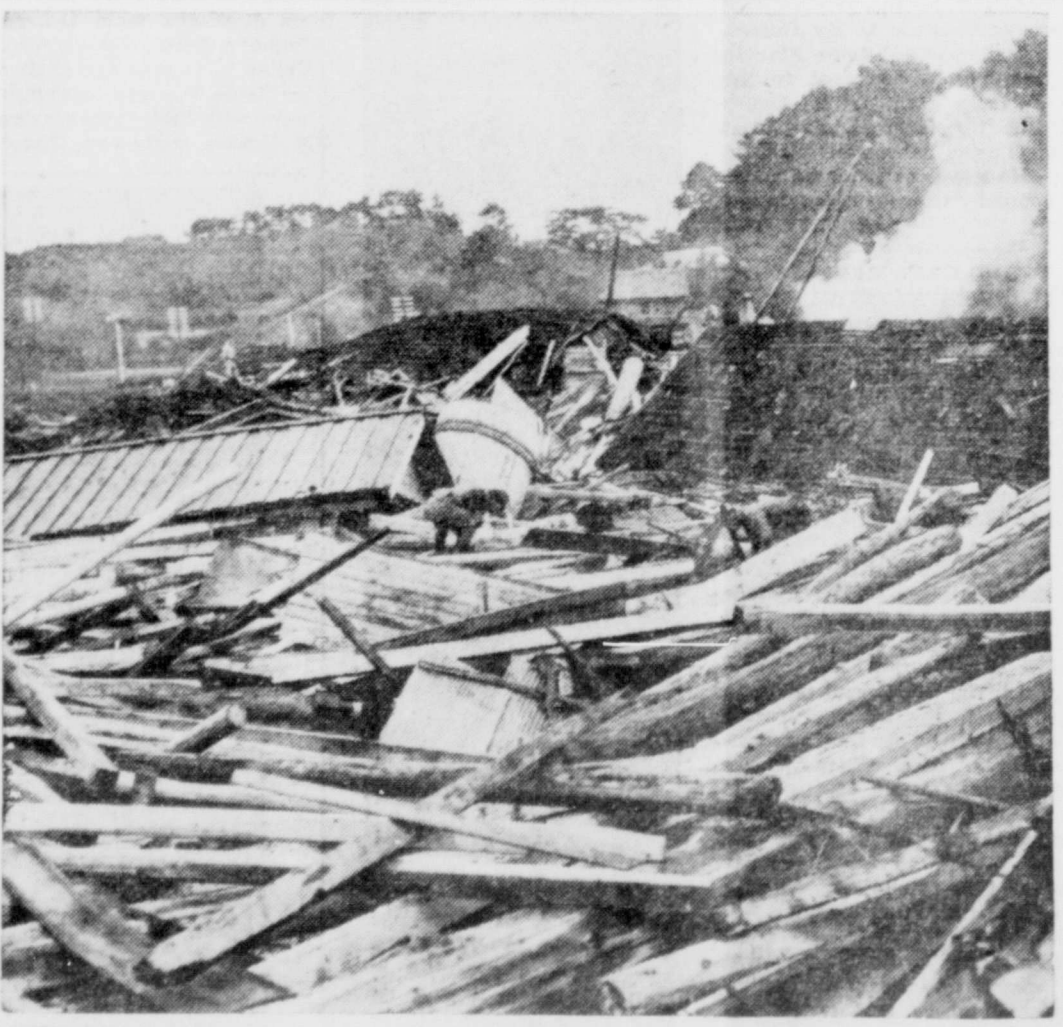
AFTER THE QUAKE-Workmen begin to clear the debris of 300 homes totally destroyed in the earthquake and tidal wave that struck Shinjo, Japan. This village in southern Wakayama prefecture was the hardest hit: 22 dead and four missing.