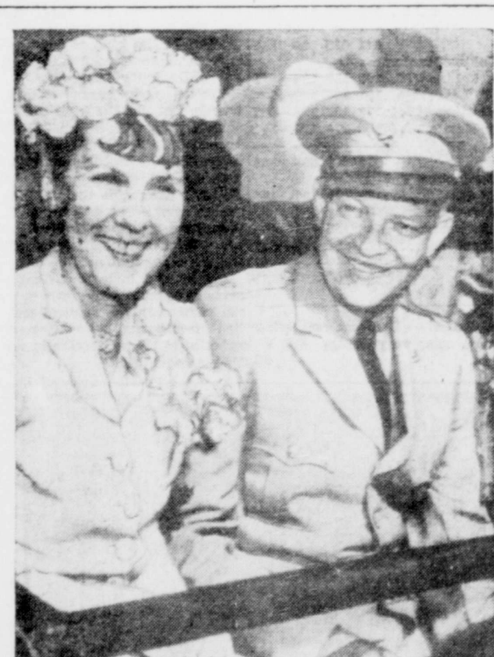
IKE AND THE MISSUS enjoy a New Year's Day in Miami at the Orange Bowl game. Here they smile from their box as they watch Rice take Tennessee, 8-0.