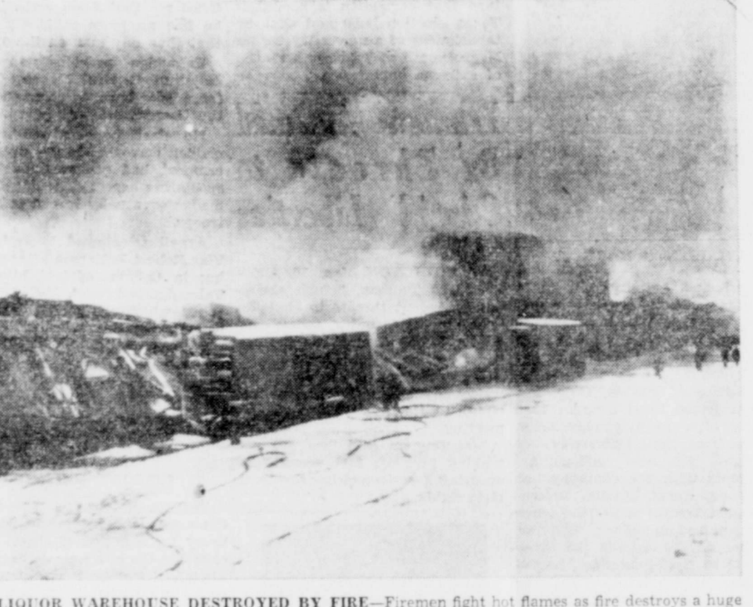
LIQUOR WAREHOUSE DESTROYED BY FIRE—Firemen fight hot flames as fire destroys a huge liquor warehouse and trucking company building on Albany's waterfront. Damage was estimated at $1,000,000. Half of this amount was liquor stock.