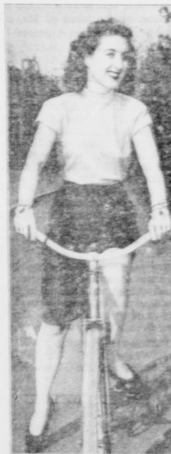
BETTY GARRETT, beautiful singing star of the Broadway hit, "Call Me Mister," spends her free time bicycling in New York's Central Park. Miss Garrett says her daily rides not only give her relaxation, but keep her weight where it should be.