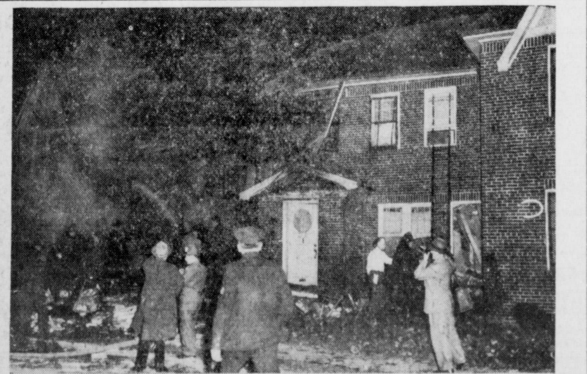
THREE ALARM FIRE —Three members of police emergency squad were killed in the explosion that demolished smoke hidden house at left and set fire to houses on either side in Jamaica, L. I. Here firemen extinguish fire and rescue occupants.

We like inflation for ourselves, when it is going our way, but generally we prefer to deflate the thought of the Golden Rule. May I submit that production is the Golden Rule way to steer ourselves out of this jam and to keep the traditional American freedoms we so much cherish.