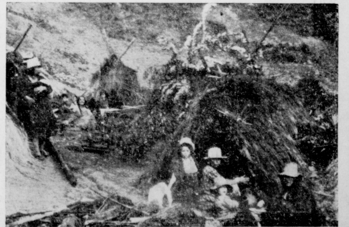
PERUVIANS TAKE TO HUTS —Peasants of the district of Conchucos, Peru, who lost their homes in an earthquake, took refuge in grass huts. Here members of several families cook meals for other members of their families on improvised wood fires.

In The Man's Store advertisement of Sunday, the Daily Press, by mistake gave the price of the New Jarman "Million-Aire" shoes for men as "$5.85 to $8.85 for most styles." This was an error on the part of the mechanical department of the Press, the order having been to print the advertisement minus any reference to price or prices.