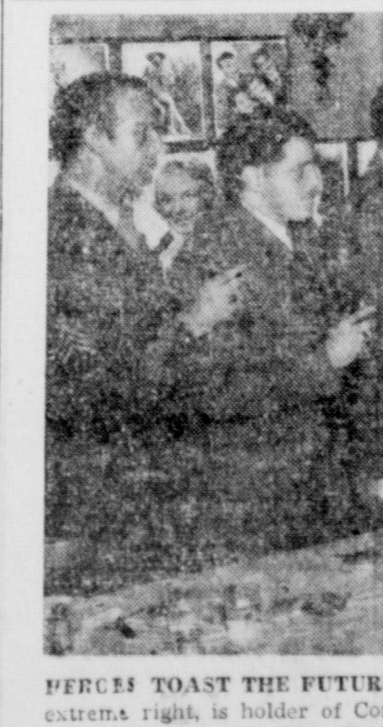
MERCE'S TOAST THE FUTURE—Each man in this photo, except the proprietor of the restaurant, extreme right, is holder of Congressional Medal of Honor for service to his country. Here they meet in New York city to form club bearing the name of their award.