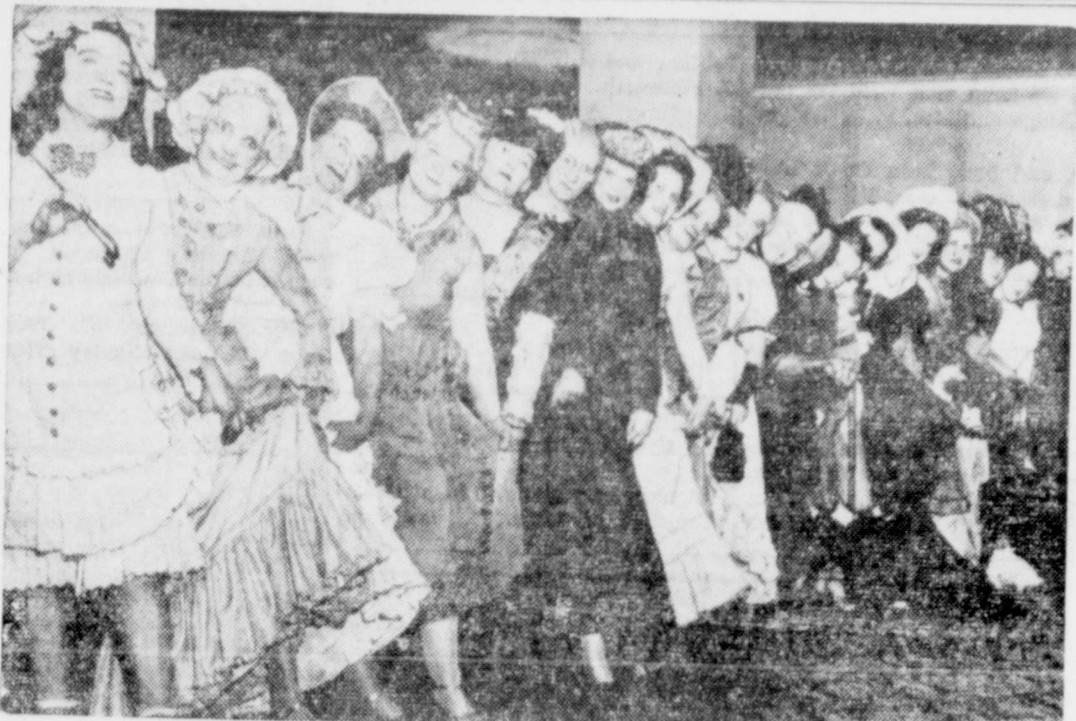
GRANDMOTHERS ALL —Wearing costumes of the gay nineties, these grandmothers line up for contest for the most typical "grandmother" in Chicago at convention of Grandmothers' Clubs, Inc. Rules required that gowns be authentic, not copies.