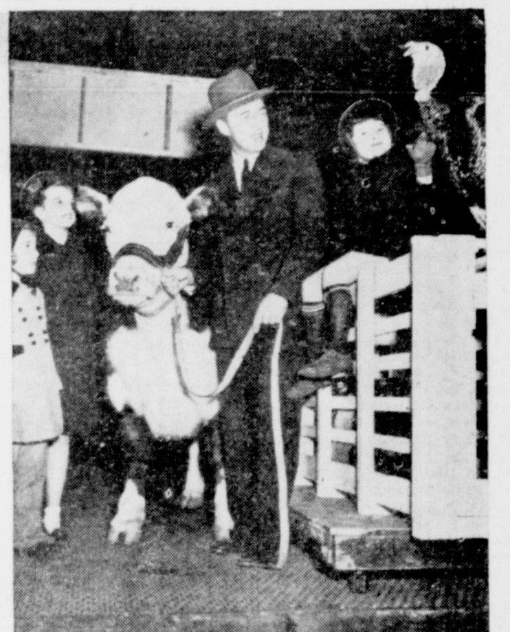
GETTING ACQUAINTED—These Bronx, N.Y., children gather around to get a closer look at the farm animals, a rare sight to them. The animals will be awarded to those attending the National Hotel Exposition who come closest to guessing the weight of the steer.