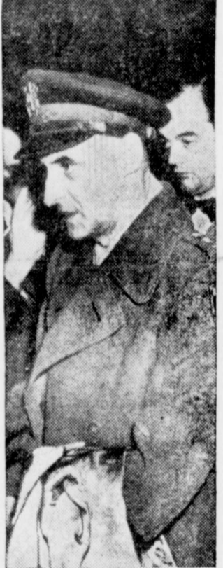
EUROPEAN COMMANDER Lt. Gen. Lucius D. Clay, Deputy Military Governor of the American Occupation Zone in Germany, talks to reporters as he arrived in Washington, D.C.