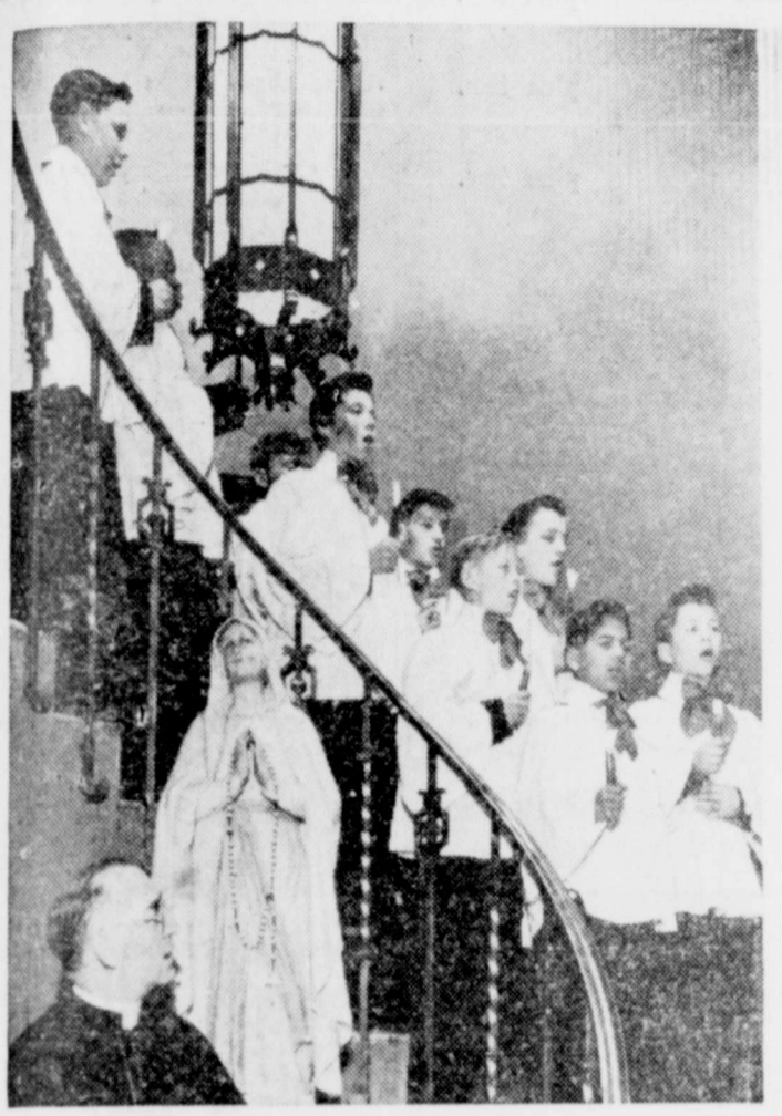
BOYS TOWN CHOIR—Father Flanagan, founder, and director of famed Boys Town, Neb., waits for members of his choir to descend the staircase as the tenor section makes its entrance in performance in New York City. Choir is on nationwide tour.