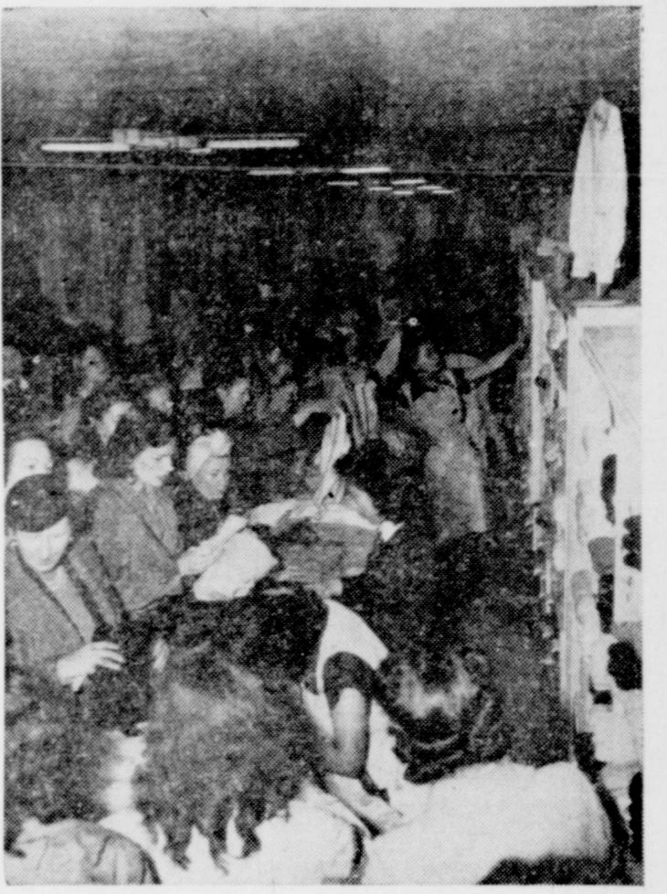
SHOPPING DAY IN TOKYO—American customers, mostly women, jam the counters of the new Tokyo PX to buy long-scarce items ranging from pink sweaters and nail polish to electric irons and phonograph records, as the world's largest Army Post Exchange opened on The Ginza. The PX features a restaurant, barber and beauty shop, a nursery, and a dry cleaning and tailor shop.