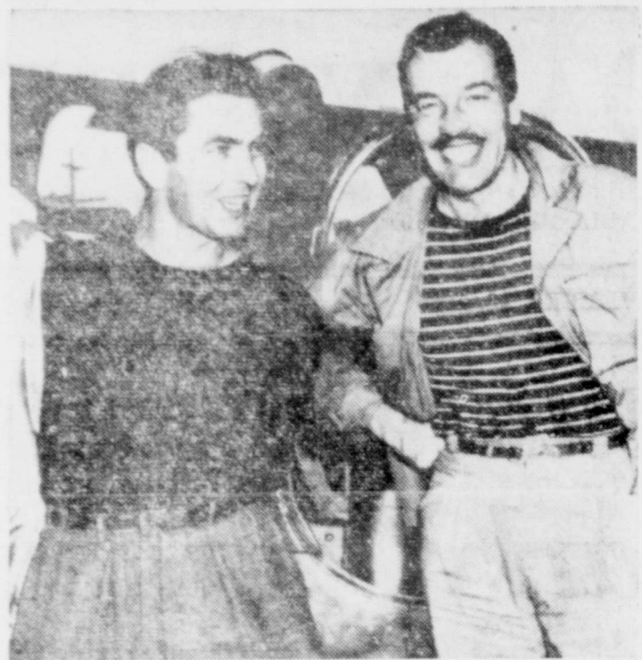
BACK HOME—Tyrone Power, left, and Cesar Romero smile as they leave their twin-engine plane after arriving at a Santa Monica, Calif., airport. The actors made a 20,000 mile goodwill tour through South America.