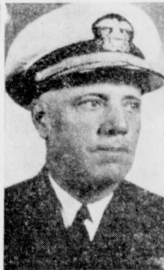
WARNING — Rear Admiral Charles A. Pownall, above, Commandant of the Marianas, told newsmen the U.S. Navy is not prepared to defend the west coast of U.S. against attack.

NEW YORK, Nov. 6. (U.P.)—Italy served notice on the Big Four foreign ministers today that it would never accept voluntarily the proposed compromise boundary line with Yugoslavia, and Yugoslavia reiterated for different reasons that the line which involves Trieste was "inacceptable."