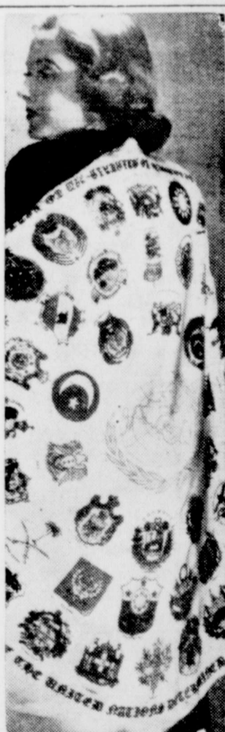
UNITED NATIONS SCARF—This scarf, worn by a model, bears the seal of each member nation of the UN. All women delegates and delegates' wives received one of the colorful fabrics.