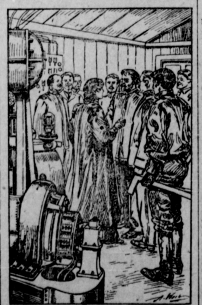
periment is a Failure."

They looked to the other side of the room, whither he had retreated, and beheld him jumping up and down like