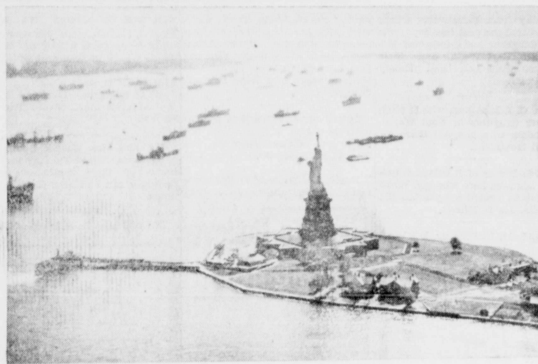
SHE KEEPS WATCH-Under the faithful watch of the Statue of Liberty, these ships lie idle waiting for the shipping strike to end. In Upper Bay, these vessels are part of the 400 tied up in the New York Harbor. Over 1200 ships of all kinds were idle in the nation's ports.