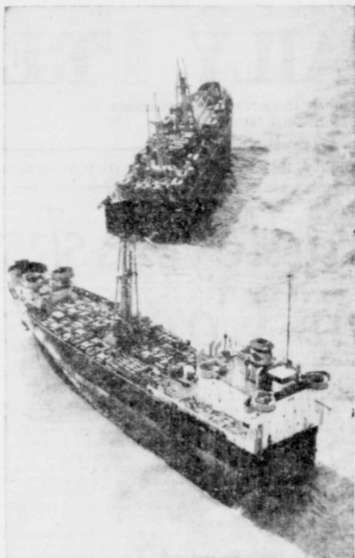
SEVERED —The 7,000 ton U.S. steamer Helen Modjeska, damaged when it ran aground off the English Coast, lies broken in two as a result of Britain's worst gale since 1909. Wind velocity reached 100 miles per hour. The captain of the vessel died shortly after the steamer was stranded, reportedly from an overdose of sleeping tablets.