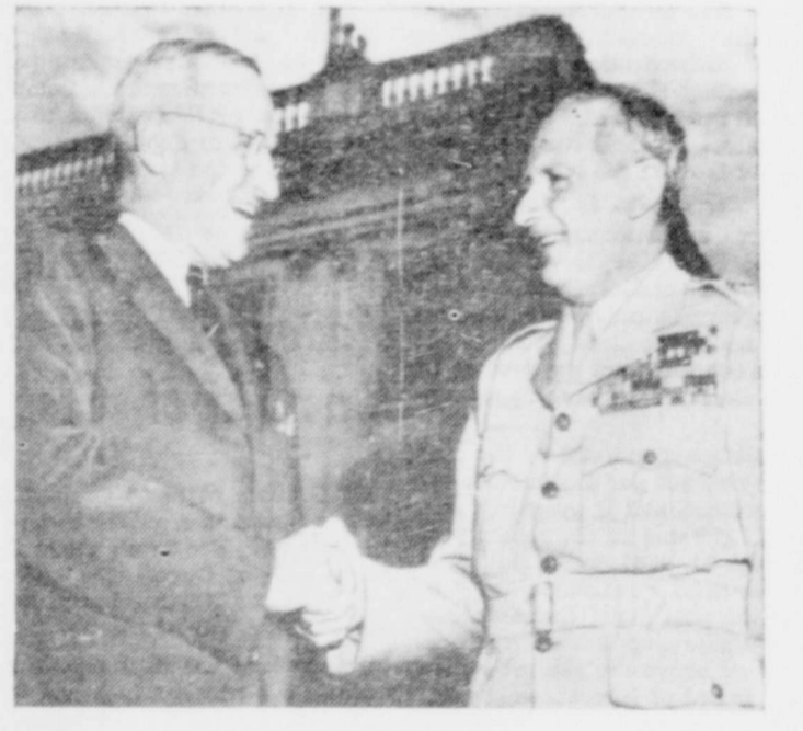
MONTY MEETS THE PRESIDENT —British Field Marshal Bernard L. Montgomery and President Truman enjoy a laugh on the White House steps when the former field commander suggested that England should pay for White House the British burned in 1814.