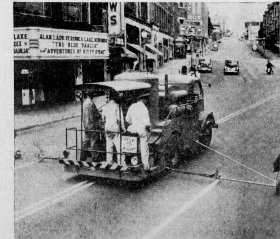
IT'S NEW—This new traffic striping in Tacoma, Wash., speeds up traffic line painting. Designed and built by Carl Sohmer, the device is operated by three men, lining 12 blocks in as many minutes. The equipment averages about 25 miles a day.

For further information, contact Sergeant Standley at Cisco post-office building.