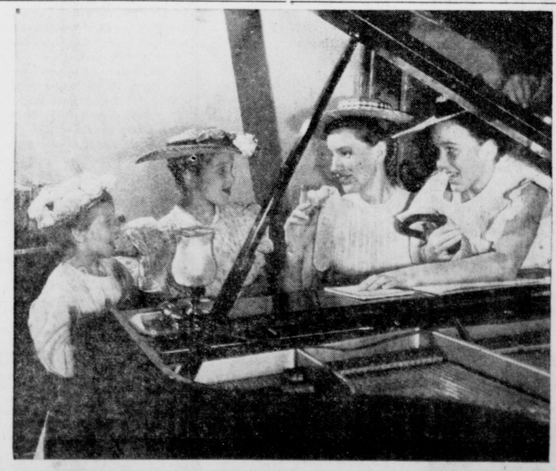
FOLK SONG SINGERS —With the popularity of American folk songs increasing, even the young are joining in. Minnie Pearl, veteran radio comedienne, instructs these youngsters in the art of radio technique in presenting the old songs for broadcasts.