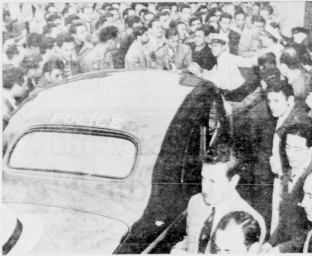
DISAPPOINTED VETERANS —After waiting in line for hours at War Assets Administration warehouse in Brooklyn for announced sale of surplus supplies of bedsheeting, these veterans break ranks when they are told that all surpluses were bought by priority government agencies.

You'd say, "You've lost a little weight." I'd say, "You haven't changed." We wouldn't grope or hesitate! I met it all arranged. I met you on the thoroughfare. My heart stood still. And then now dead seems to be the strongest voice the Democrats can muster for their cause. And this despite the fact that the atomic