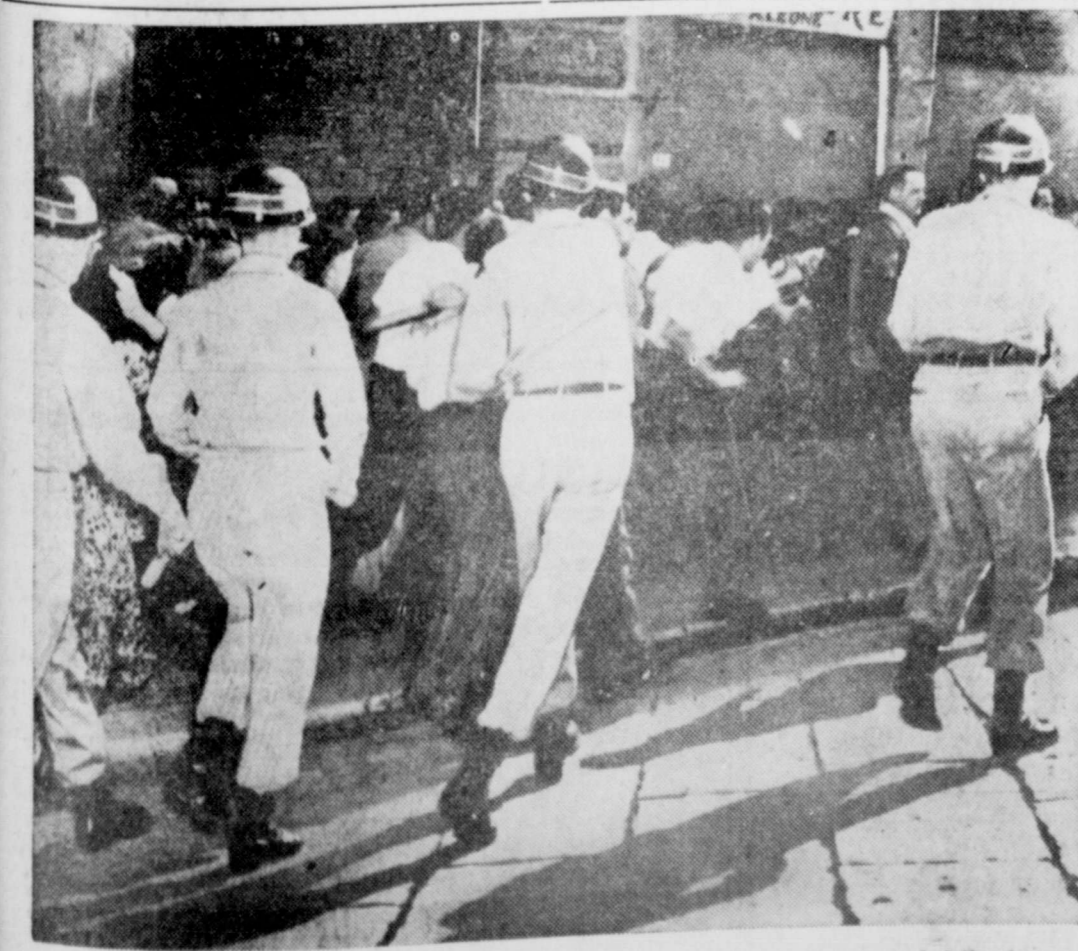
TROUBLE IN TRIESTE —American military police charge a demonstrating crowd following an explosion of a hand grenade in Trieste, Italy. Seven MP's were injured when they were called to maintain order during a pro-Yugoslav demonstration.

FOR SALE — Everbearing strawberry plants. 1101 west Twelfth street, Cisco. 276