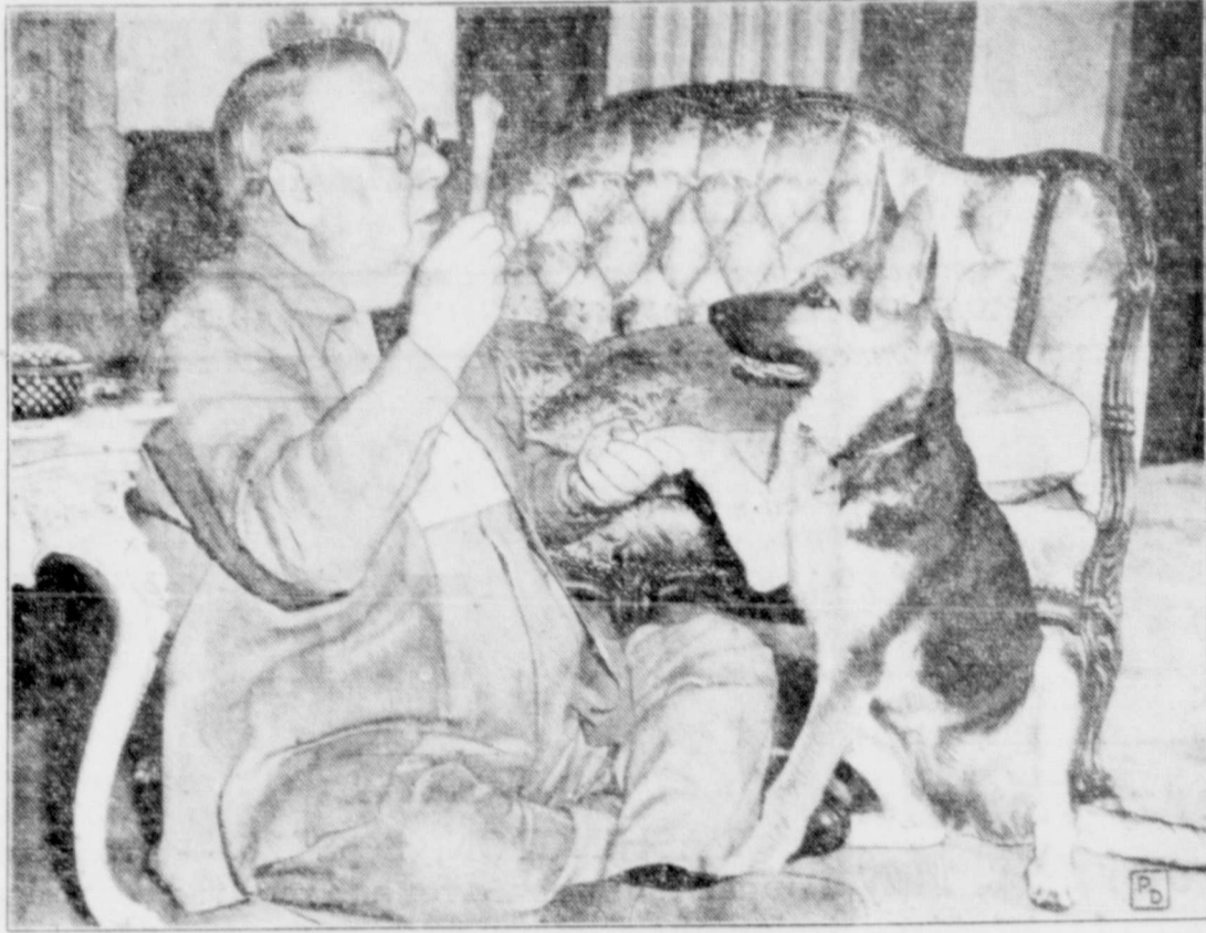
WHO'S KIDDING WHO? S. Z. Sakall, Hollywood star, isn't fooling his pet German Shepherd a bit. Even with the shortage of canned dog food he will still have to produce something better than that rubber bone. Mr. Sakall will appear soon in Warner Brothers' "The Time, The Place, and The Girl."