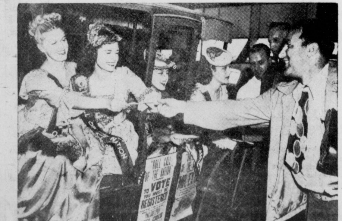
CAMPAIGNERS —As a part of the "Roll Call of the Nation" program in Philadelphia, these colonial costumed beauties distribute pamphlets in an endeavor to have every citizen vote. The campaign is sponsored by the Philadelphia Boosters Association.

P-51 Mustang Set World Record in Ohio Trophy Race