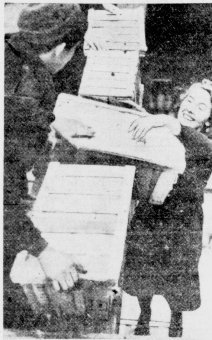
TOMATOES FOR OSLO HOUSEWIVES —When Oslo, Norway, dock workers refused to unload a cargo of tomatoes from the Canary Islands as protest against the Franco regime, angry Norwegian women stormed the ship and unloaded cargo.