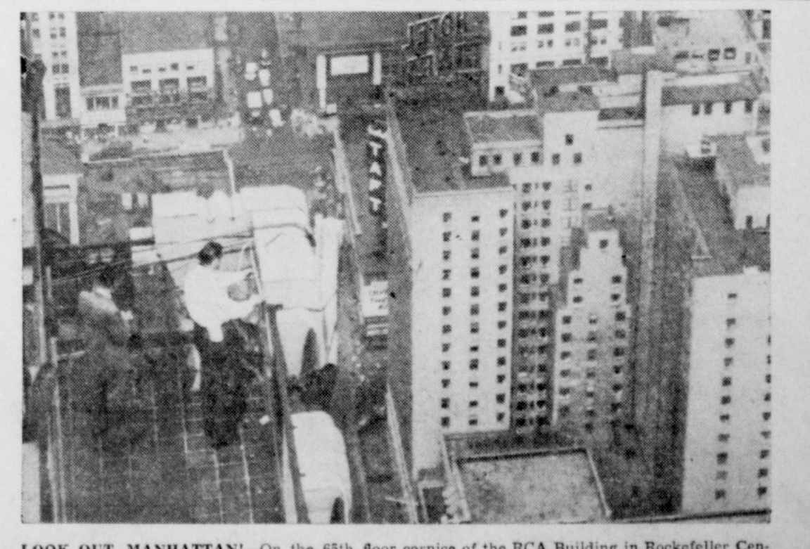
LOOK OUT, MANHATTAN! —On the 65th floor cornice of the RCA Building in Rockefeller Center, New York City, workmen secure 800-pound limestone blocks. The blocks were shaken loose by lightning, authorities believe. View was taken from the 69th floor.