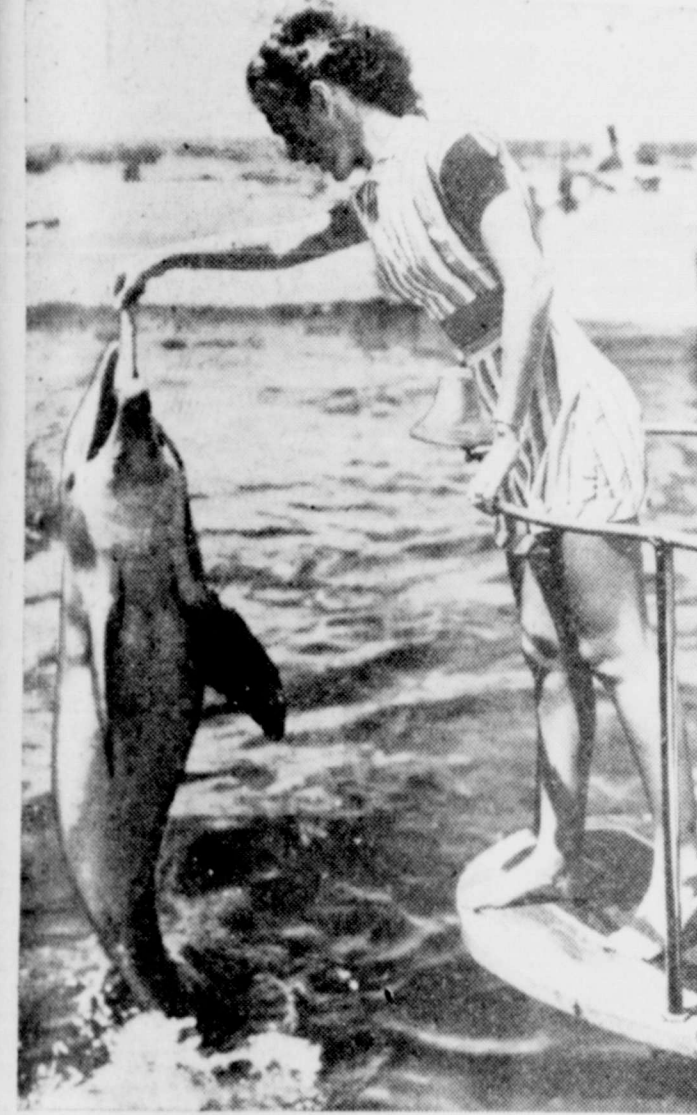
THE POISE OF A PORPOISE —Getting his first food from a sightseer is this porpoise, at Marineland, Fla. Closed at the outbreak of the war, the famous aquarium is now open to the public. Here the playful dolphin goes for a high one.