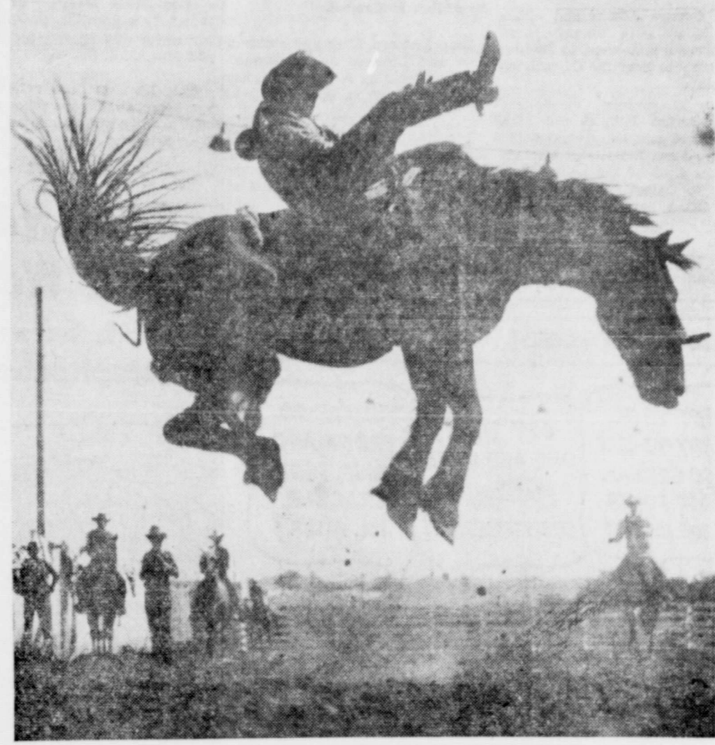
An unusual picture of a Dublin rodeo bronc really "In the Air." The Preview Madison Square Garden Rodeo will be held in Dublin, Texas, on the nights of Sept. 12, 13, 14 and 15, just before the World's Championship Rodeo Corporation embarks by special train from Dublin for Madison Square Garden show.