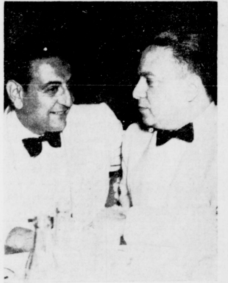
IN A CHORD —Famous bandleaders Guy Lombardo, left, and Vincent Lopez get together at New York City's Waldorf-Astoria to exchange a few notes. And from the looks on their faces the key to the whole situation seems to be complete harmony.

"We must do everything within our power to reduce inflationary pressures. One of the most effective means of doing this is to reduce federal expenditures."