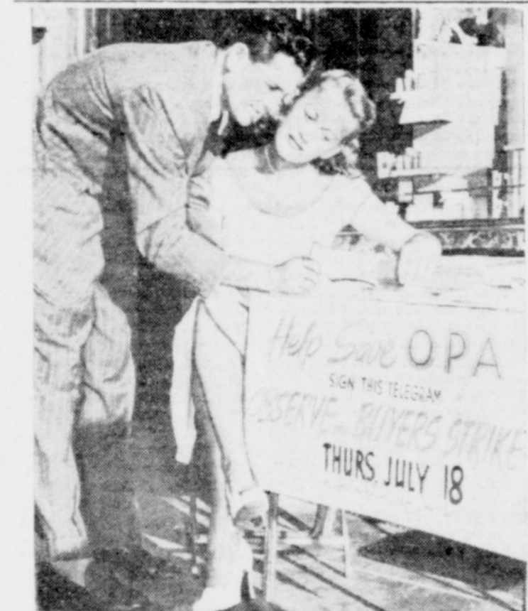
ALL FOR OPA—Hollywood star John Garfield takes his turn at signing a petition asking for a stronger OPA bill. Gorgeous songstress Georgia Gibbs helps strengthen the plea.