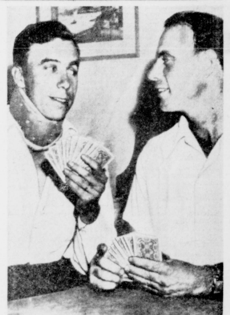
OUT OF ONE GAME AND INTO ANOTHER —A chipped vertebra kept Brooklyn's Pee Wee Reese from the National League All-Star line-up. But pitcher Kirby Higbe, right, tries to console his teammate with a hand of cards in Boston. Reese was hurt during a Dodgers-Braves double header.

Buyers' strikes begun in several cities last week were reported in additional communities as the nation awaited decisive congressional action on controls.