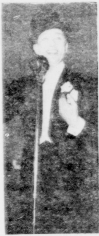
CARL BRISSON, Swedish entertainer, has reason to smile. He received final papers for U.S. citizenship in New York.

Grace Lutheran. "Our High Calling as Regards the World" will be the theme of the sermon this morning. Sunday school and Bible classes at 10 and service at 11. Sunday school teachers' meeting Wednesday night at 8. Next Sunday's sermon