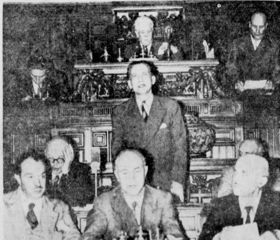
ITALIAN ASSEMBLY, NEW STYLE —Alcide de Gasperi, provisional chief of the Italian State, is shown as he addressed the opening meeting of the new Constituent Assembly at Montecitorio Palace in Rome. Scene is quite a contrast to the once-familiar balcony stands of Mussolini's day.