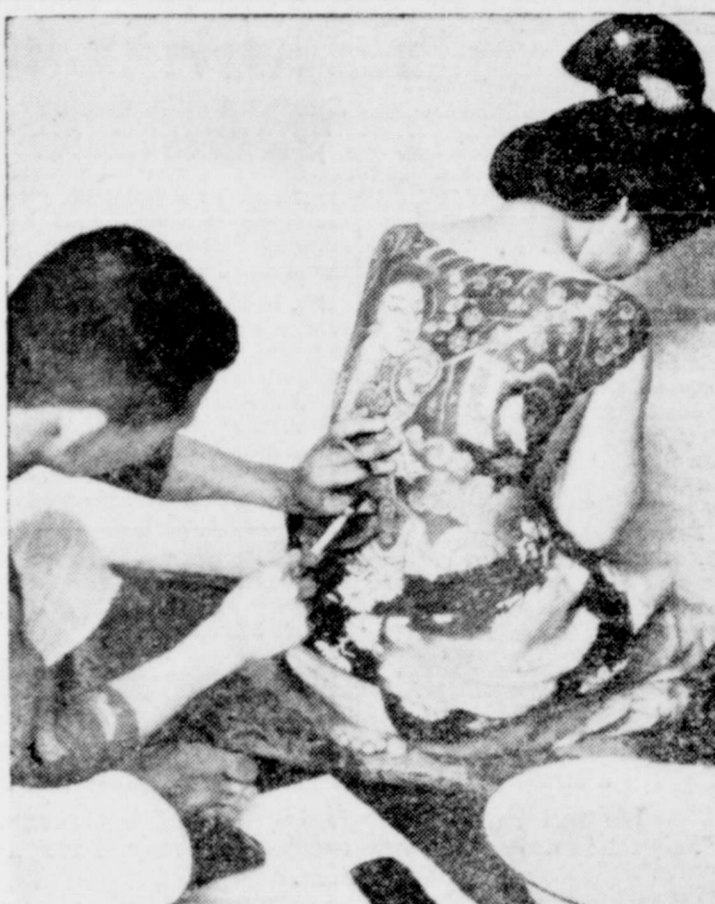
AN ANCIENT, BUT ILLEGAL ART —In defiance of the law, many Japanese still get their bodies tattooed. Here an expert in Tokyo imprints his weird designs on the body of a woman. Tattooing was made illegal by the Japanese government many years ago and offenders still are liable to arrest.

WASHINGTON, July 10. — The agricultural department said today chances are good that the American farmer will produce another bumper food crop this year, including a record corn crop of 3,341,616,000 bushels. "The current outlook for total crop production has seldom been surpassed," the department said. "A record corn crop and near-record crops of wheat, oats, potatoes and rice appear in prospect." "Except for 1942, the reported condition of all crops is the best in seven years." The milk amendment was sponsored by Sen. Kenneth S. Wherry, R., Neb., who last night pushed through an amendment forbidding price ceilings on meat, poultry and eggs. The milk amendment was adopted by a vote of 51 to 27. It was the third successive setback to administration efforts to get through the Senate a price control bill to replace the amendment-riddled measure which President Truman vetoed June 29. Earlier today the Senate adopted 42 to 31 an amendment by Sen. James O. Eastland, D., Miss., to prevent price ceilings on cottonseed and soybeans and their oil by-products. There was strong indication that the senate would also vote to eliminate price ceilings on petroleum, tobacco and possibly other commodities. This raised the possibility that the new compromise bill might confront another presidential veto.