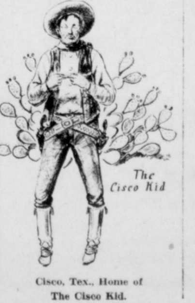
Cisco, Tex., Home of The Cisco Kid.