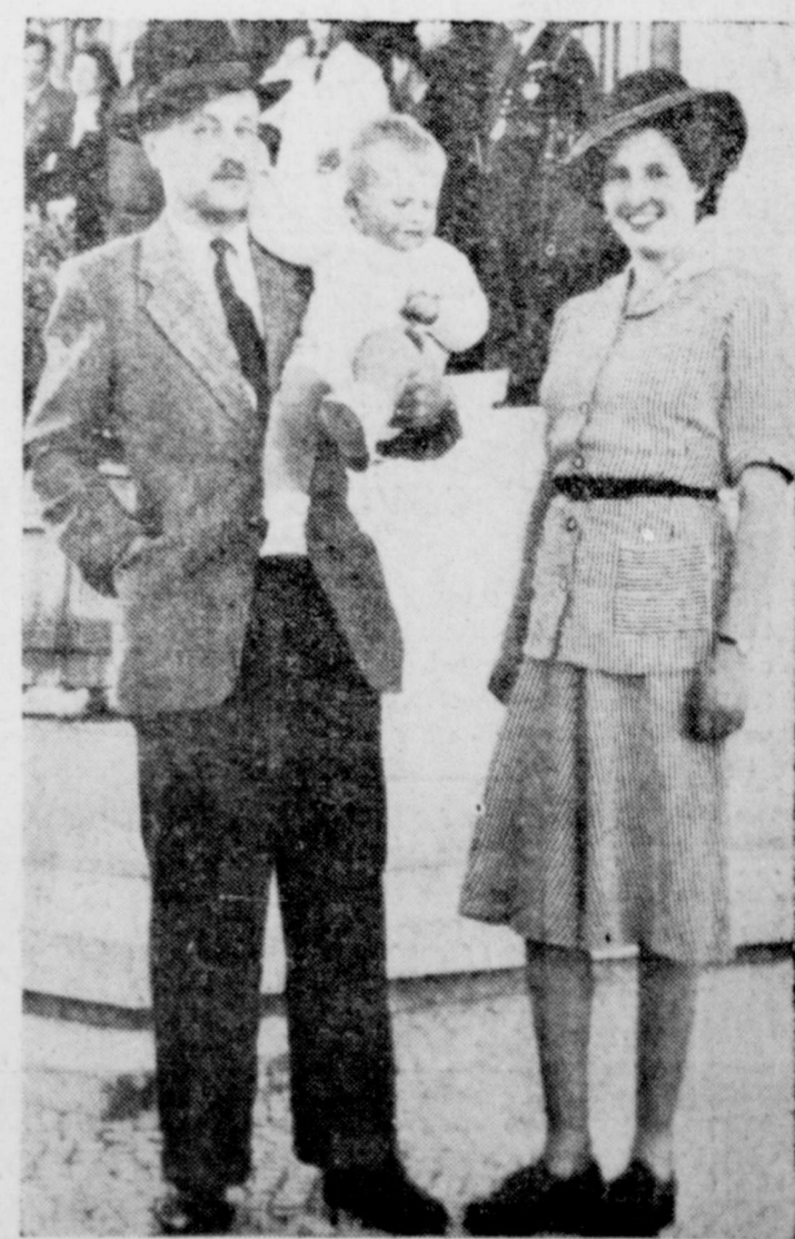
PORTUGUESE PRETENDER — Dom Duarte Nuno, Duke of Braganza, pretender to the Portuguese throne, arrives in Lisbon with his wife and infant son.