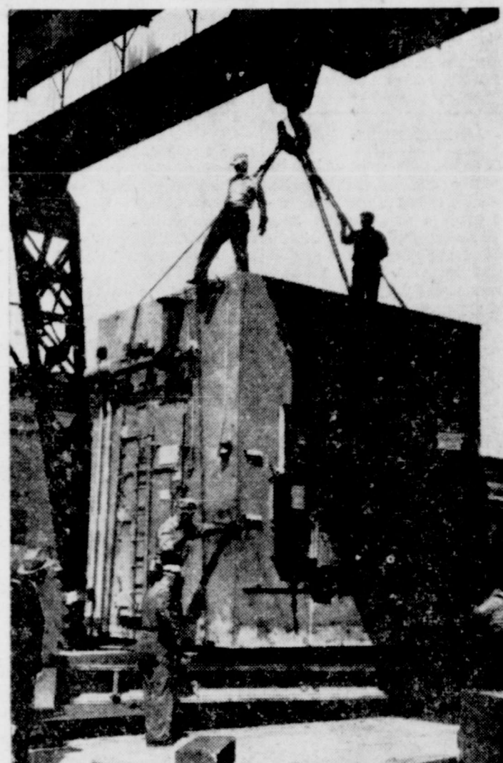
CLIMATE CONTROL —The 35-ton adjustable weather chamber would answer man's ambition to be cool in the summer and warm in winter, but it's strictly for testing equipment. Here the climate room is loaded aboard a huge trailer for 125-mile trip from the General Electric plant in Schenectady, N. Y. to Syracuse.

STRIKE TIES UP TOLEDO. TOLEDO, Ohio, July 2.—Public transportation in Toledo was paralyzed as a strike today of AFL operators halted all street cars and buses.