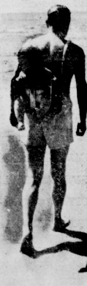
BABY PACKIN' PAPA —Baby-tending and a morning stroll along the beach are easily combined by this Papa. He just hoists the baby's car seat on his shoulders and starts walking.

The five and ten cent store firm paid $3,055,000 to the Foley Brothers Department store for a 125-foot lot at Main and McKinney. The lot, which is 250 feet deep, now is the site of the First Presbyterian church. It will be razed when a new church is completed at another site and a super five and dime store will take its place. The Foley firm said it secured the land under option for $1,250,000.