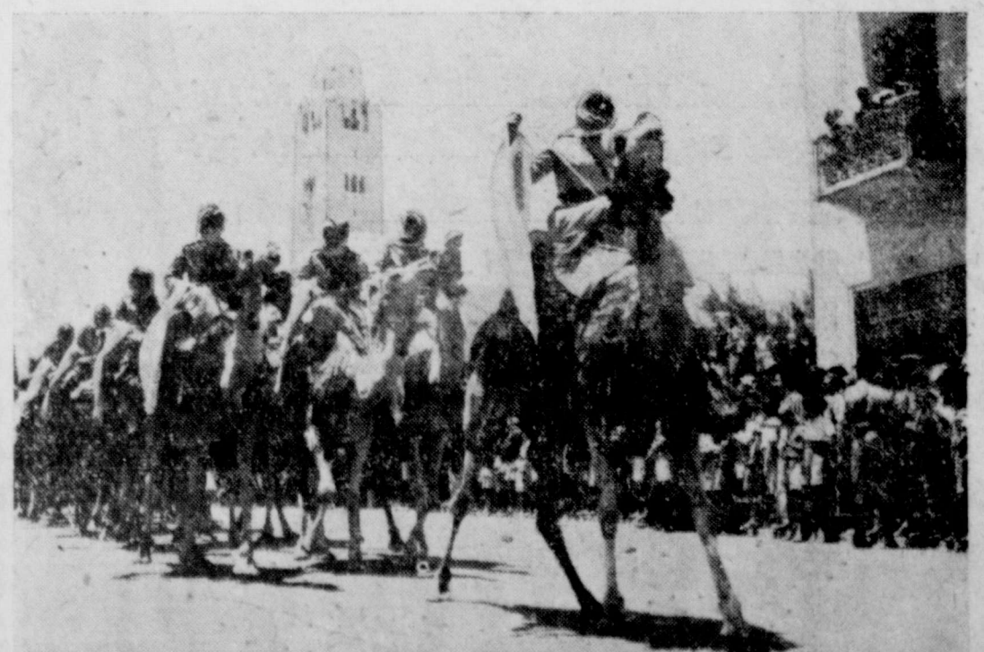
BEFORE TERROR —This camel unit of the Arab Legion paraded in Jerusalem with British forces and one small Jewish armed group in tribute to King George VI three days before terrorist uprisings broke out. Six British officers were kidnapped during the disorders.