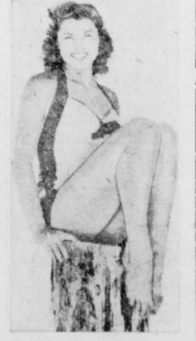
ESTHER WILLIAMS is through with bathing suits, she says. The aquatic star will wear a woman bull-fighter's costume in her new movie "Fiesta."