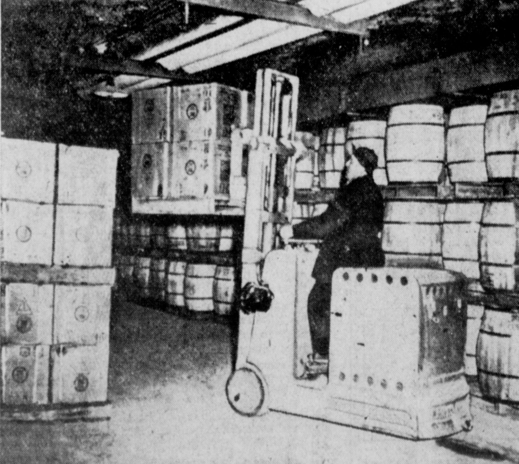
NATURAL COOLER—The world's largest natural cooler on a single floor, located in a 75-year-old limestone mine at Atchison, Kans., stores provisions for UNRRA. Here a hoist lifts eight cases of food into place. Capacity of the cooler is 92,000 tons.

this district, and has been a citizen of Odessa for more than twenty years. He attended Simmons