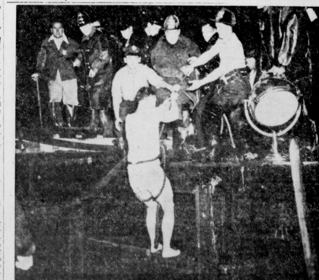
RESCUE FAILED—A fireman is pulled from the East River after his futile attempt to locate a comrade who was blown from a freighter while fighting a fire that broke out in the ship's hold. Two other firemen were rescued after exploding in New York City harbor.